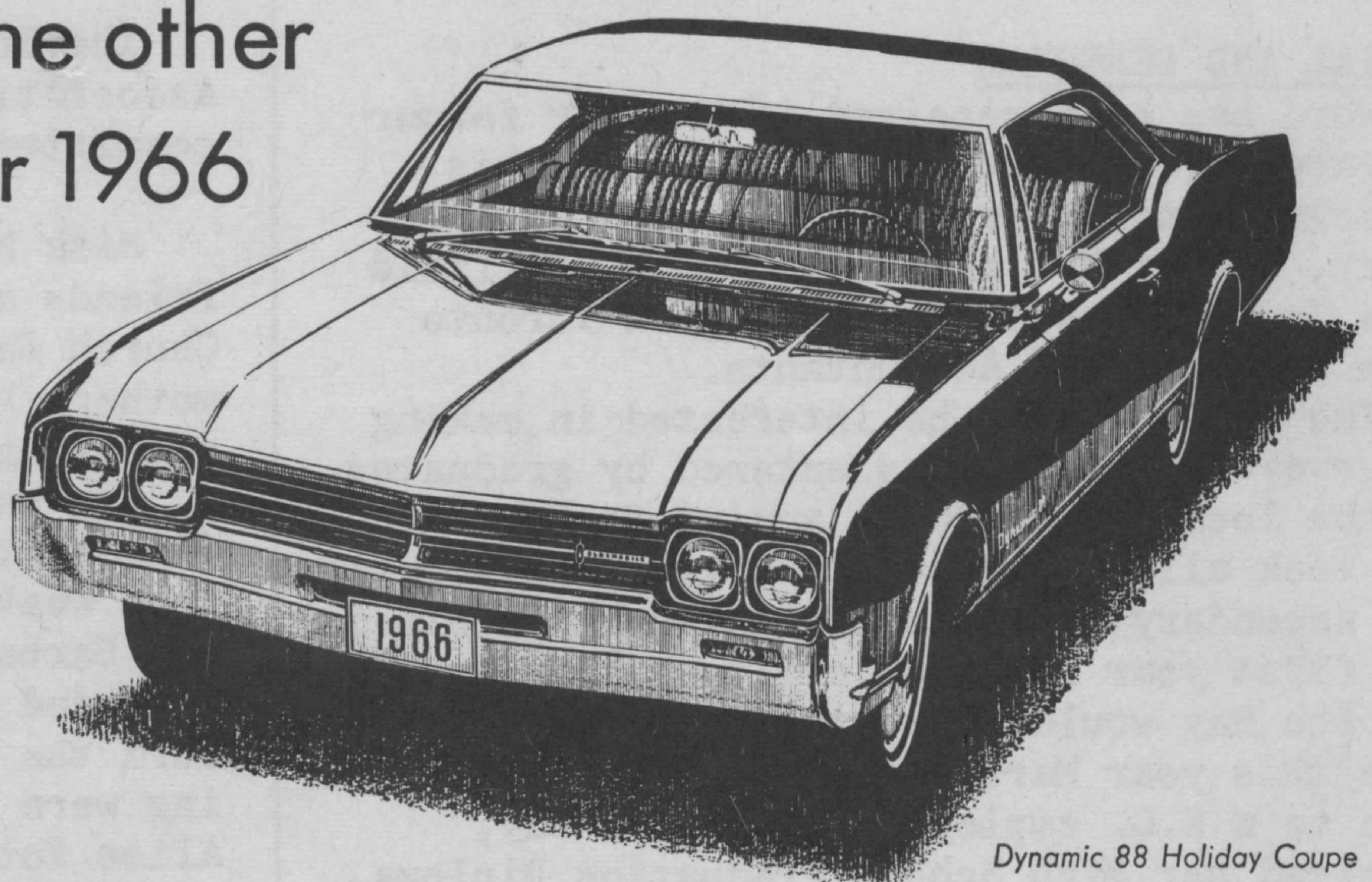
Dynamic 88 Holiday Coupe

These are some of the other new Oldsmobiles for 1966 ...they're luxurious, elegant, exciting, powerful, appealing. And all those things.