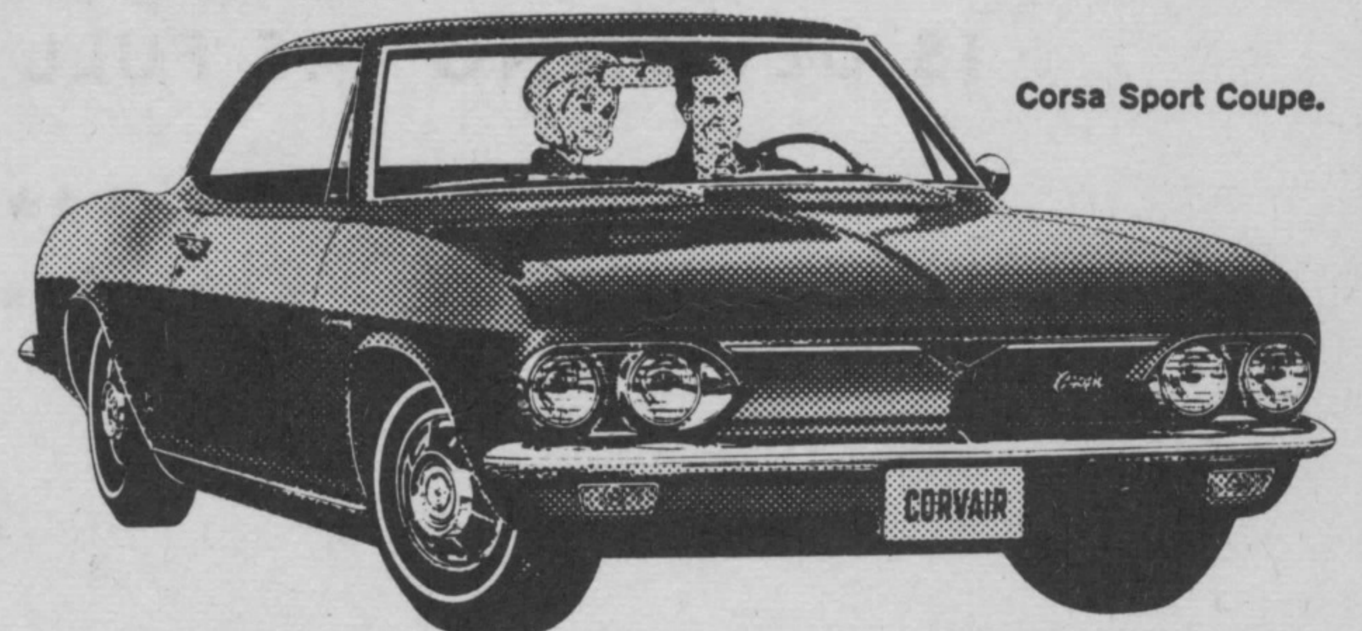
Corsa Sport Coupe.

Corvaire, like all the '66 Chevrolets, has a padded instrument panel, padded sun visors. Seat belts front and rear. Backup lights, windshield washer and 2-Speed wipers, outside rear-view mirror. Fully synchronized 3-Speed transmission. All of it standard equipment. Corsas. Monzas. 500's. Come get one. Stay young.