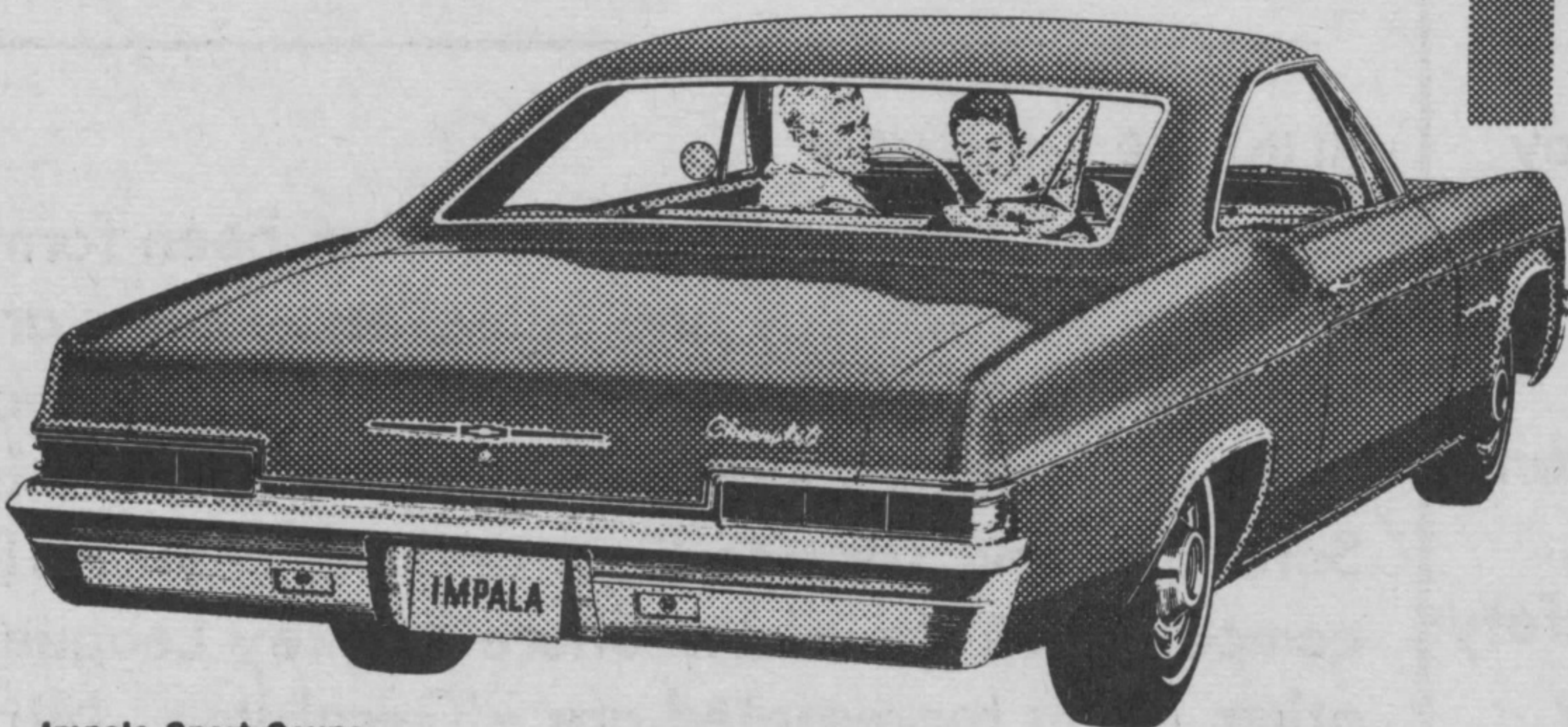
Impala Sport Coupe.

No Chevrolet has ever had a ride like this one. It's smooth, solid, quiet. You can specify a Turbo-Jet "396" engine at 325-hp. Smooth, quiet, plenty of reserve power (Just one of six engines available up to a 425-hp Turbo-Jet "427" V8). But really, there's only one way to find out all that's great about the '66 Chevrolet with its beautiful new Body by Fisher. Ride in one.