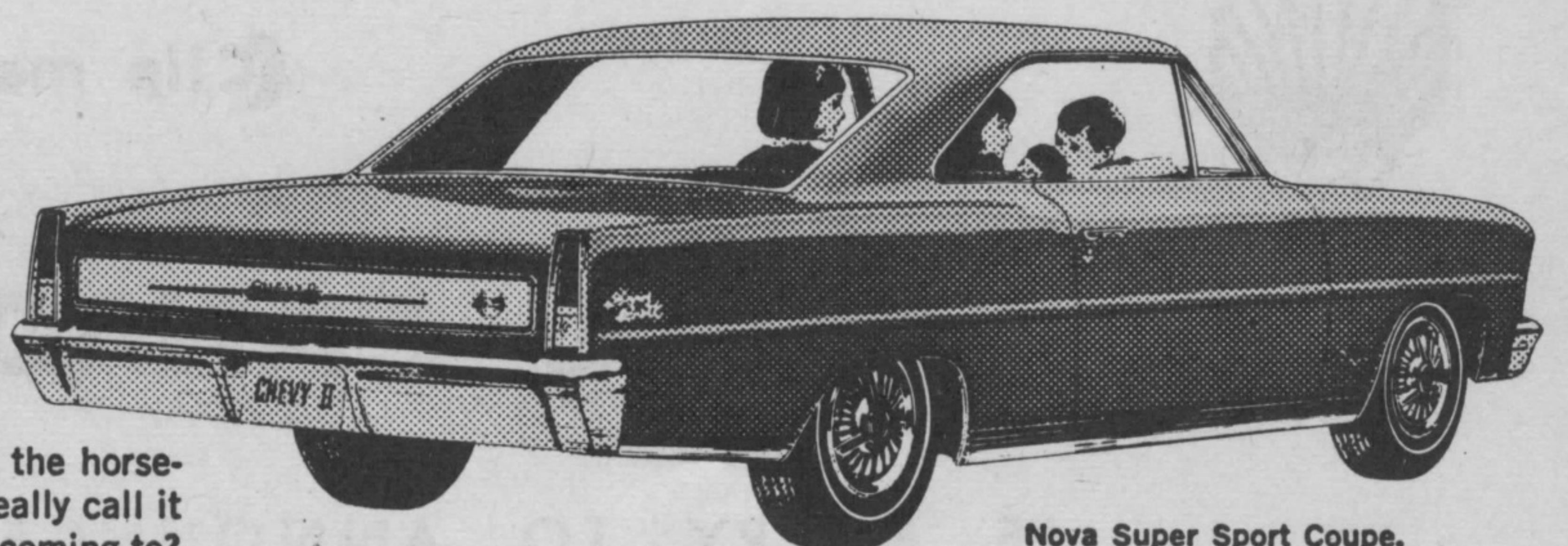
Nova Super Sport Coupe.

Chevy II is something else again for 1966. We've lowered the roof, raised the horsepower available and given it a whole new look. It's so different, we should really call it the Chevy III. What's the economical dependable, salt-of-the-earth Chevy II coming to? A lot of very smart car buyers, the way we figure it.