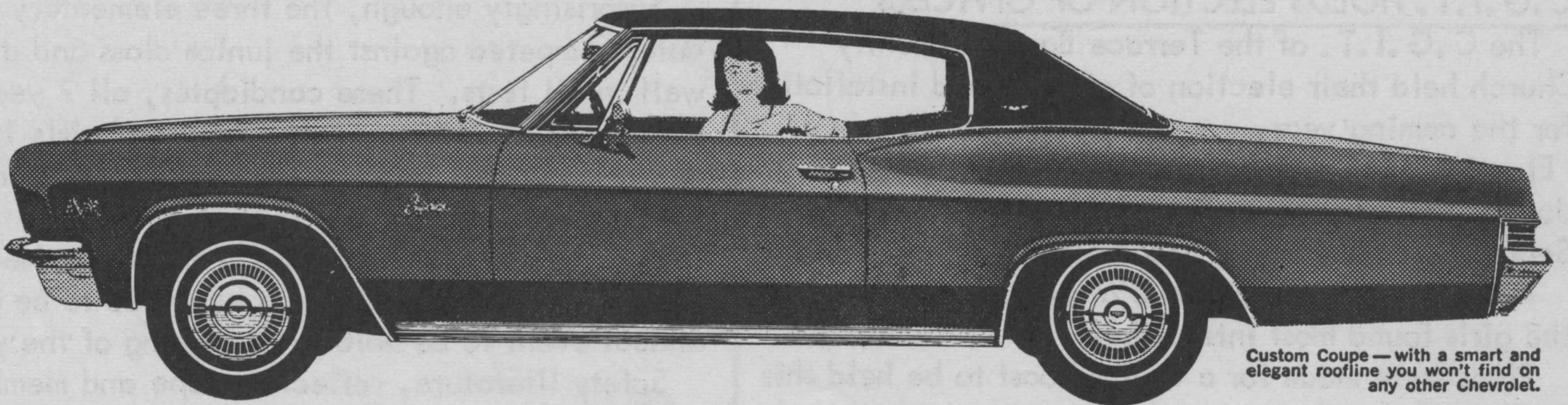
Custom Coupe — with a smart and elegant roofline you won't find on any other Chevrolet.

A whole new series of elegant new models — the most lavish Chevrolet has ever built. There's the Caprice Custom Coupe, Caprice Custom Sedan and the luxurious new Caprice Custom Wagon. Truly elegant in every detail, they invite (and deserve!) your closest inspection.