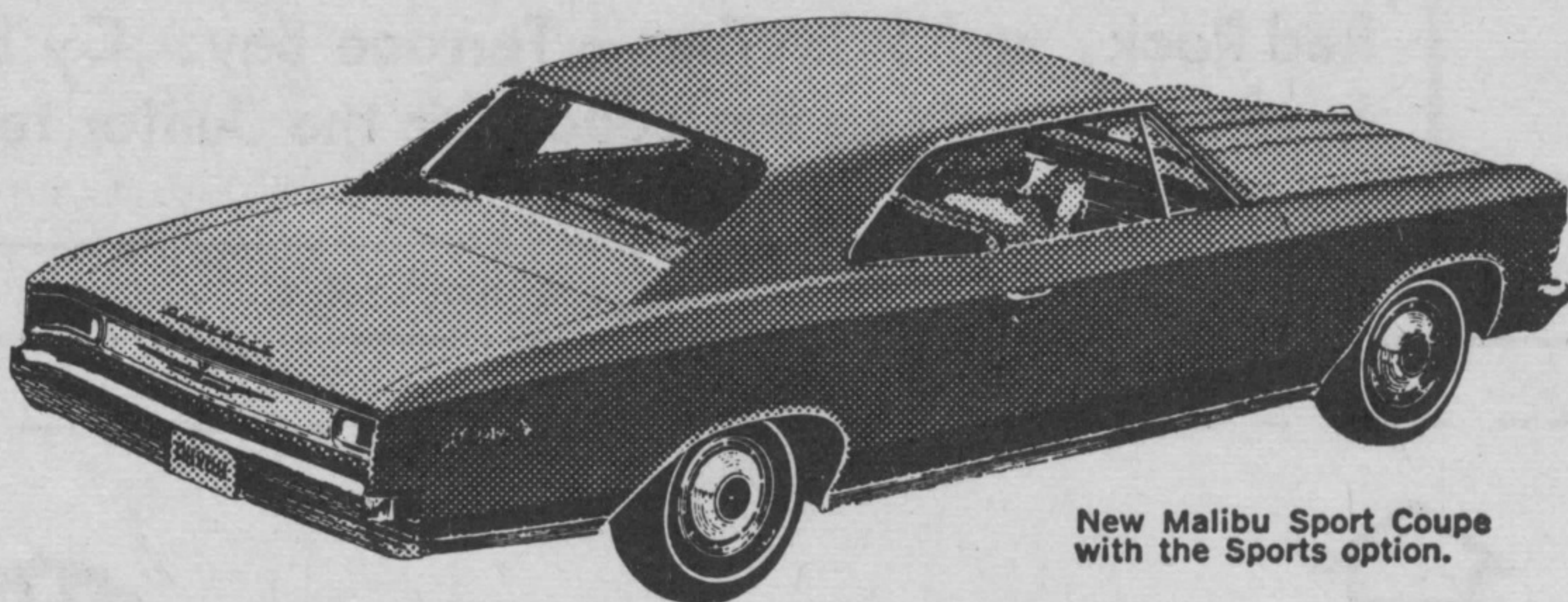
New Malibu Sport Coupe with the Sports option.

No Chevrolet has ever had a ride like this one. It's smooth, solid, quiet. You can specify a Turbo-Jet "396" engine at 325-hp. Smooth, quiet, plenty of reserve power (Just one of six engines available up to a 425-hp Turbo-Jet "427" V8). But really, there's only one way to find out all that's great about the '66 Chevrolet with its beautiful new Body by Fisher. Ride in one.