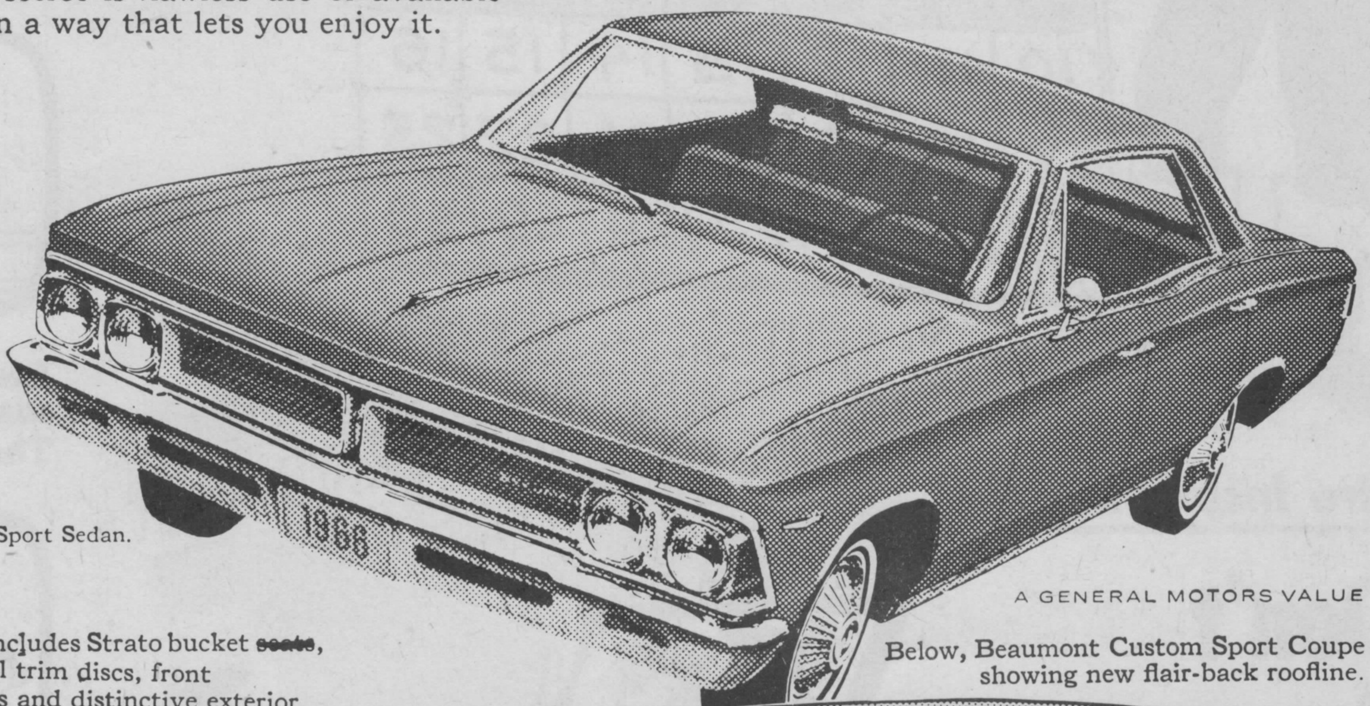
Beaumont Custom Sport Sedan.

Right Price! Look at Beaumont. Take a long look. All this luxury, eye-stopping style, and the performance to go with it, is priced remarkably low. A 120 hp six or 195 hp V8 is standard, or select a more powerful six or one of two V8s (up to 360 hp with Sports Option*). Transmissions to match. With Beaumont, everything matches.