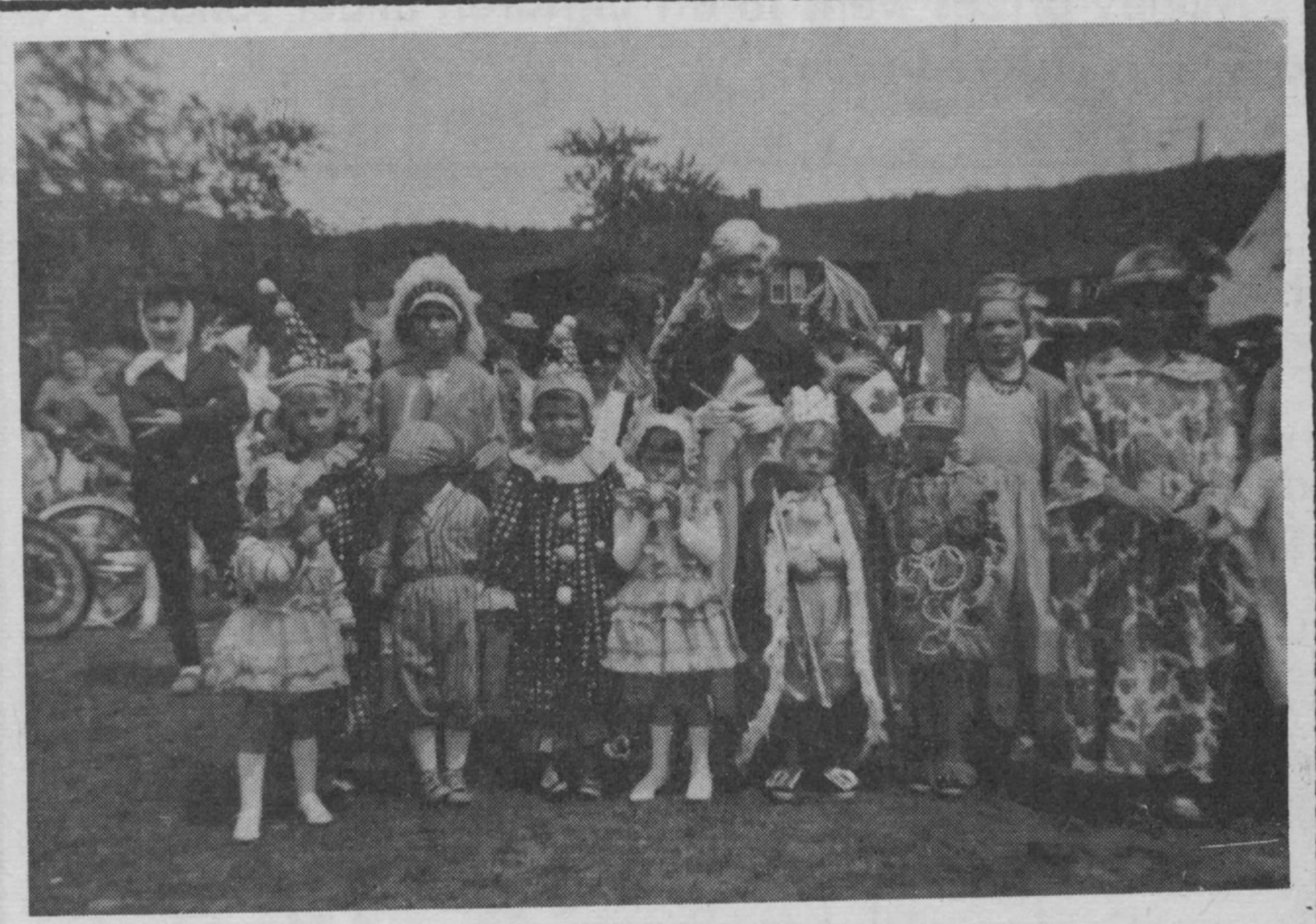
Costume winners in Kinsmen Field Day, July 1st.