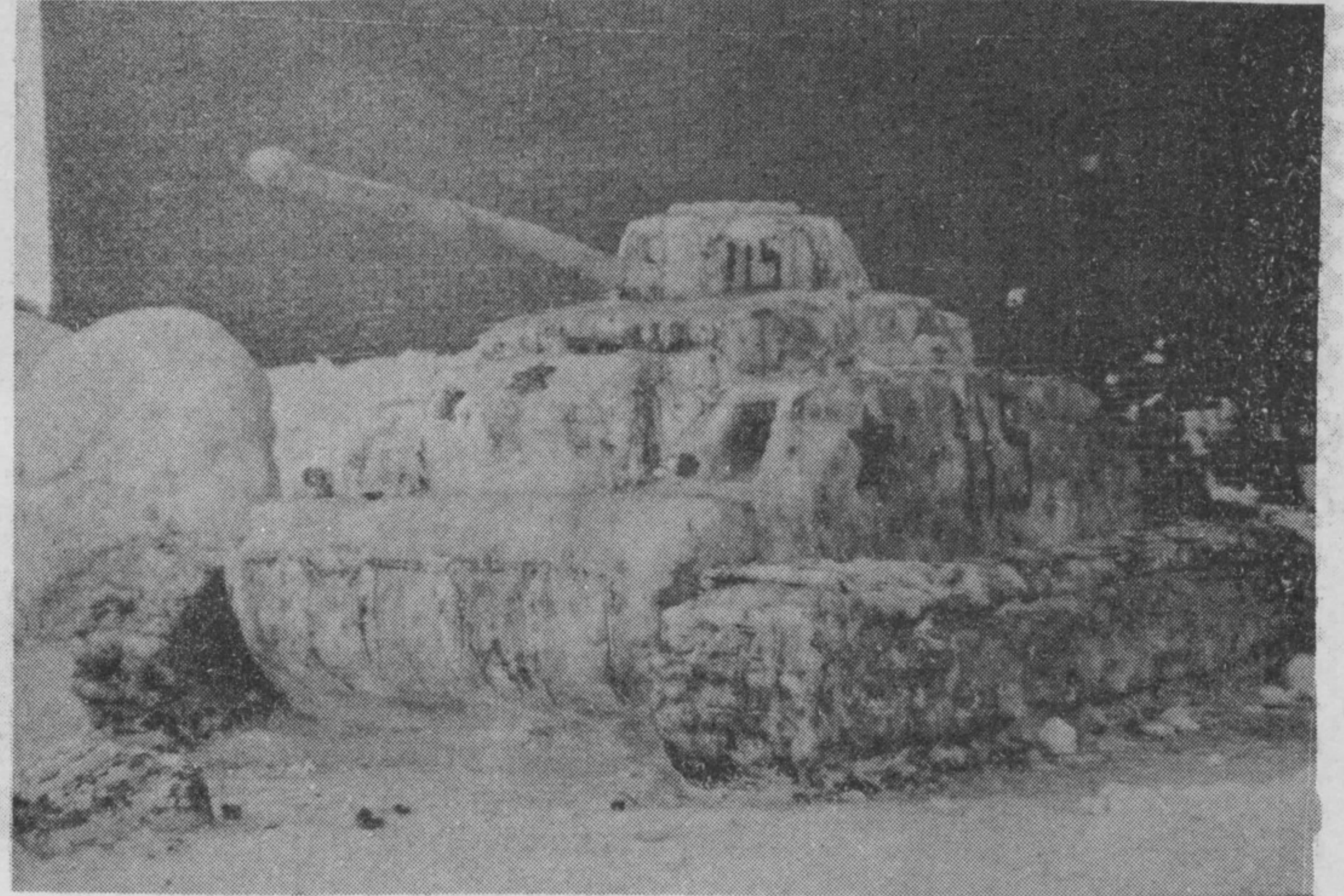
Sherman Tank Ice Sculpture - Schreiber High School Winter Carnival.

Notice was received of the Thunder Bay Municipal Convention on April 28-29-30 to be (Continued....)