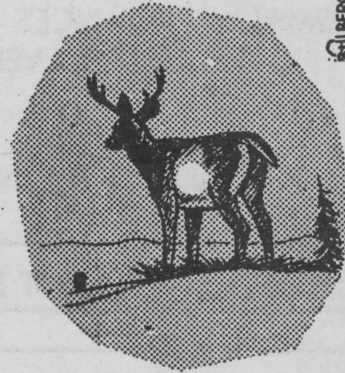
A WELL PLACED SHOT FOR A QUARTERING-AWAY DEER. AIM AT THE PAUNCH TO LINE UP WITH OPPOSITE SHOULDER.

A PAIR OF 8X OR 9X BINOCULARS ARE A MUST. TO GET YOU WITHIN SHOOTING RANGE. IT TAKES CAREFUL STALKING.