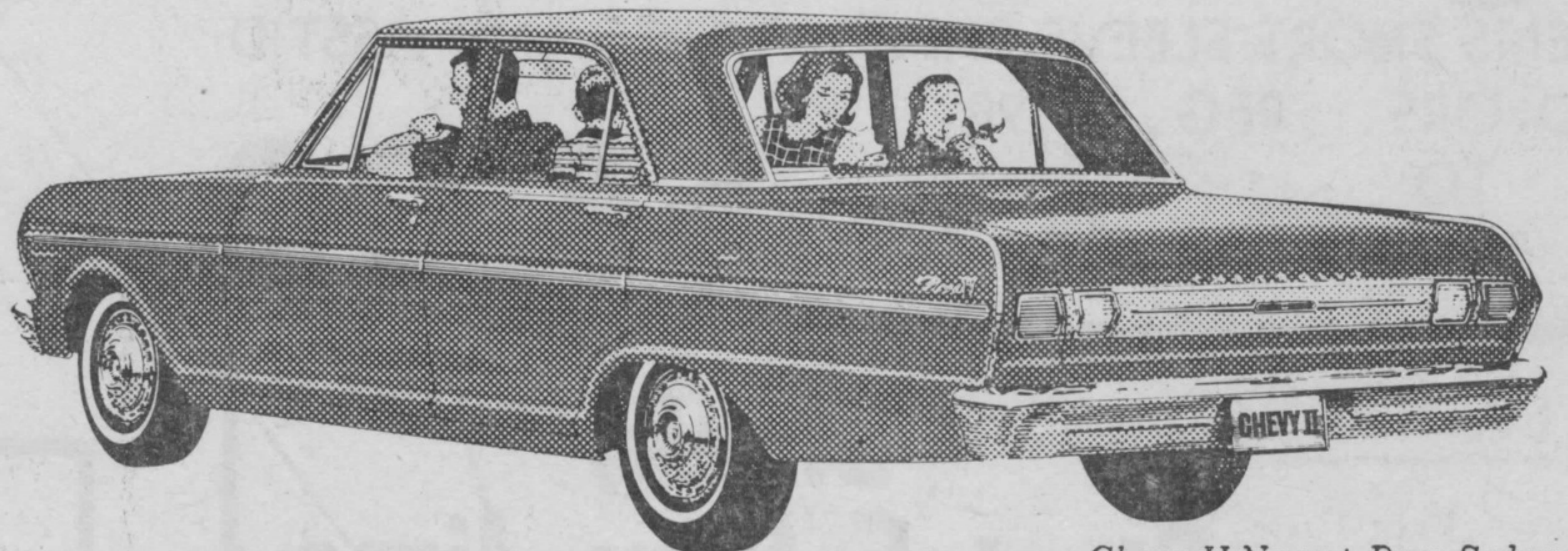
Chevy II Nova 4-Door Sedan

It may very well be the expensive-est looking thrift car you've ever laid eyes on. But thrifty it is. The big difference this year being that Chevy II's marvelous mechanical efficiency now comes decked out in a debonair new look.