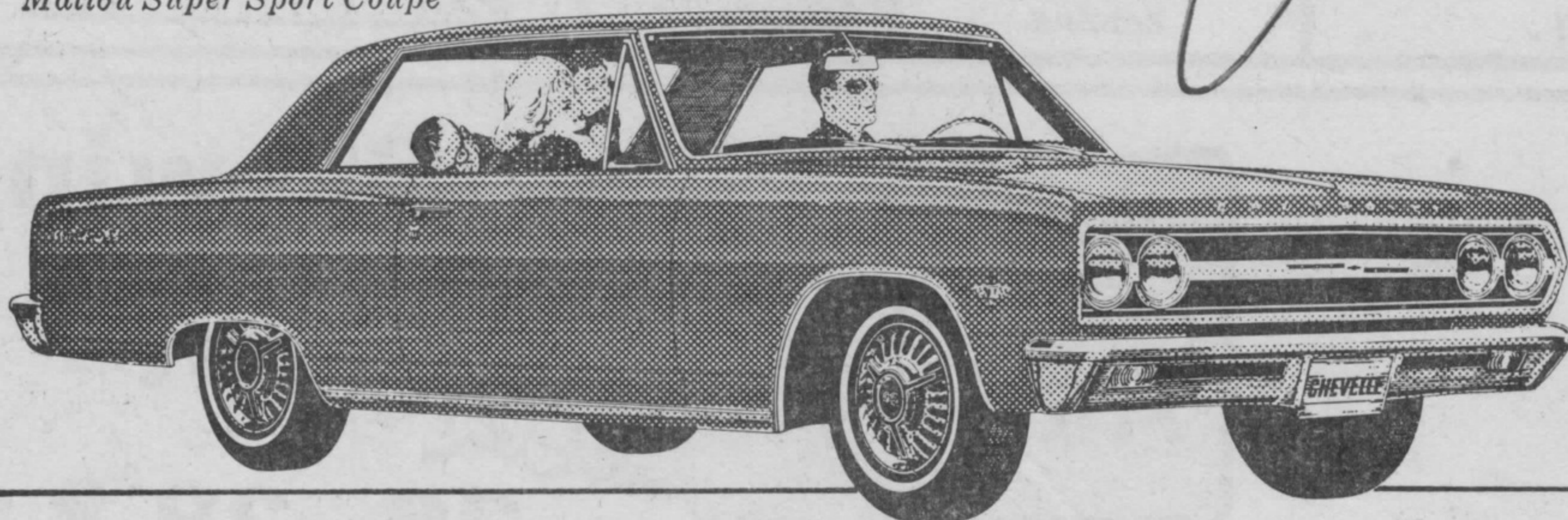
Malibu Super Sport Coupe

In fact, just about everything's new right down to the road. And even that'll seem newer because the Jet-smooth ride is smoother than ever, with a new Full Coil suspension and new Wide-Stance design.