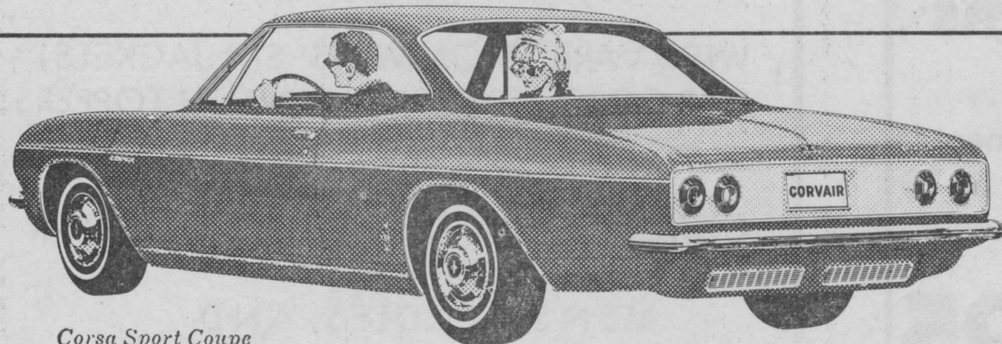
Corsa Sport Coupe