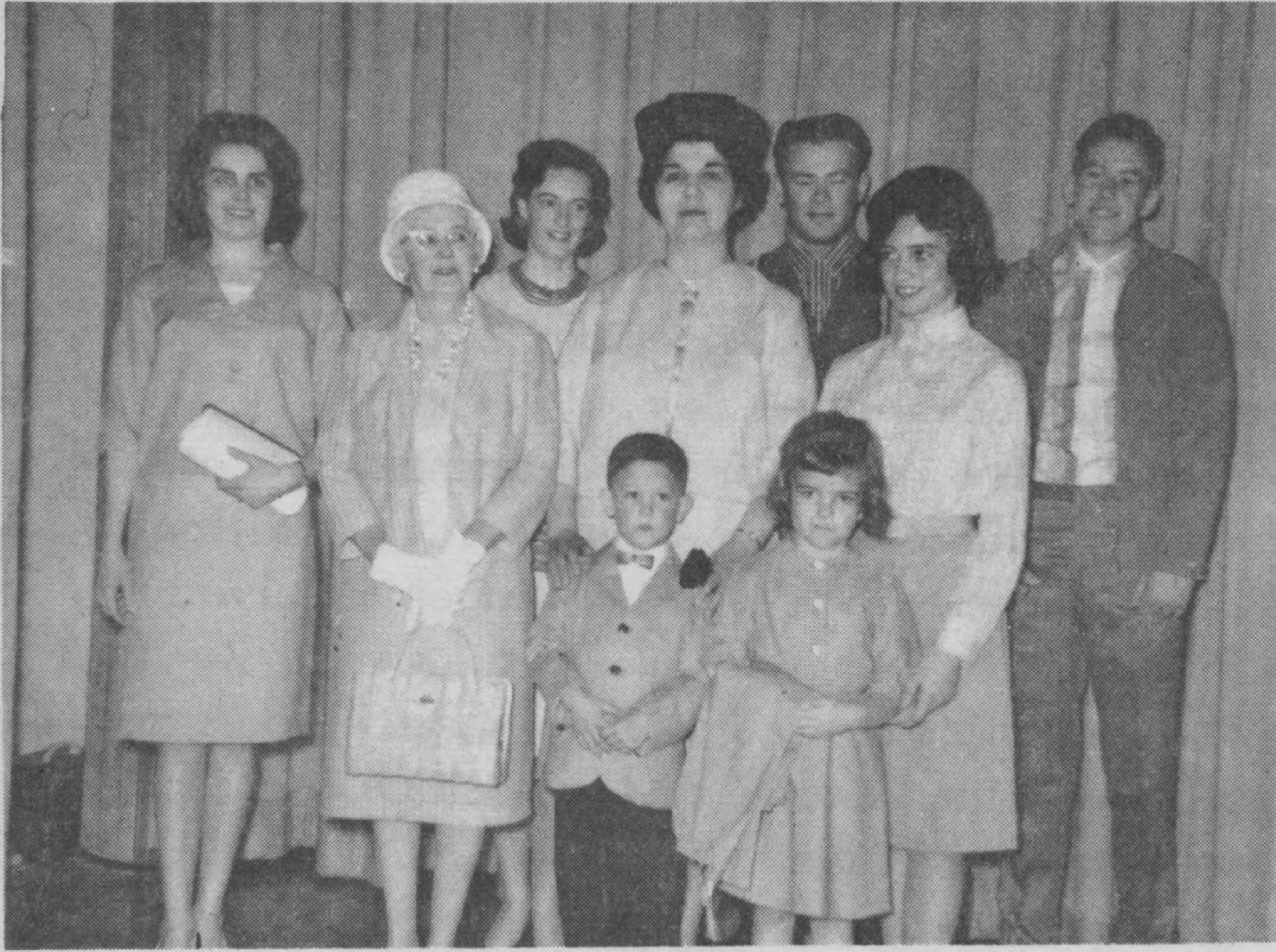
Fashion Models