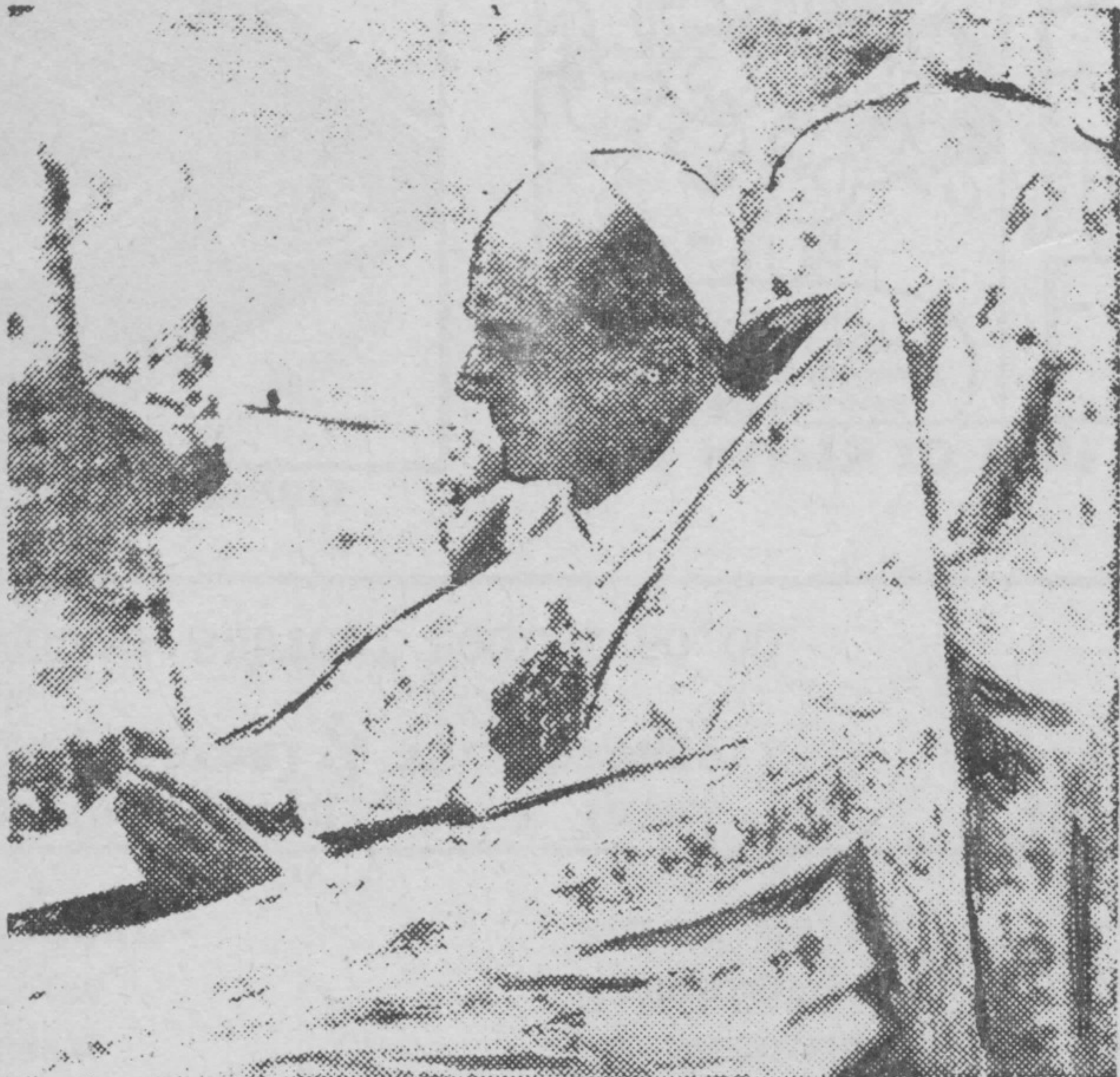
Pope Paul VI opens the Second Session.

The second session of the Ecumenical Council is grappling with the complex internal and external problems of the 500-million-member church in one of the most magnificent settings in Christendom — St. Peter's Basilica. Responding to the appeal of Pope Paul VI for Christian unity, the 2,500 cardinals, archbishops, bishops, abbots and heads of religious orders from all over the world are taking up the theme of "De Ecclesia" ("Of the Church").