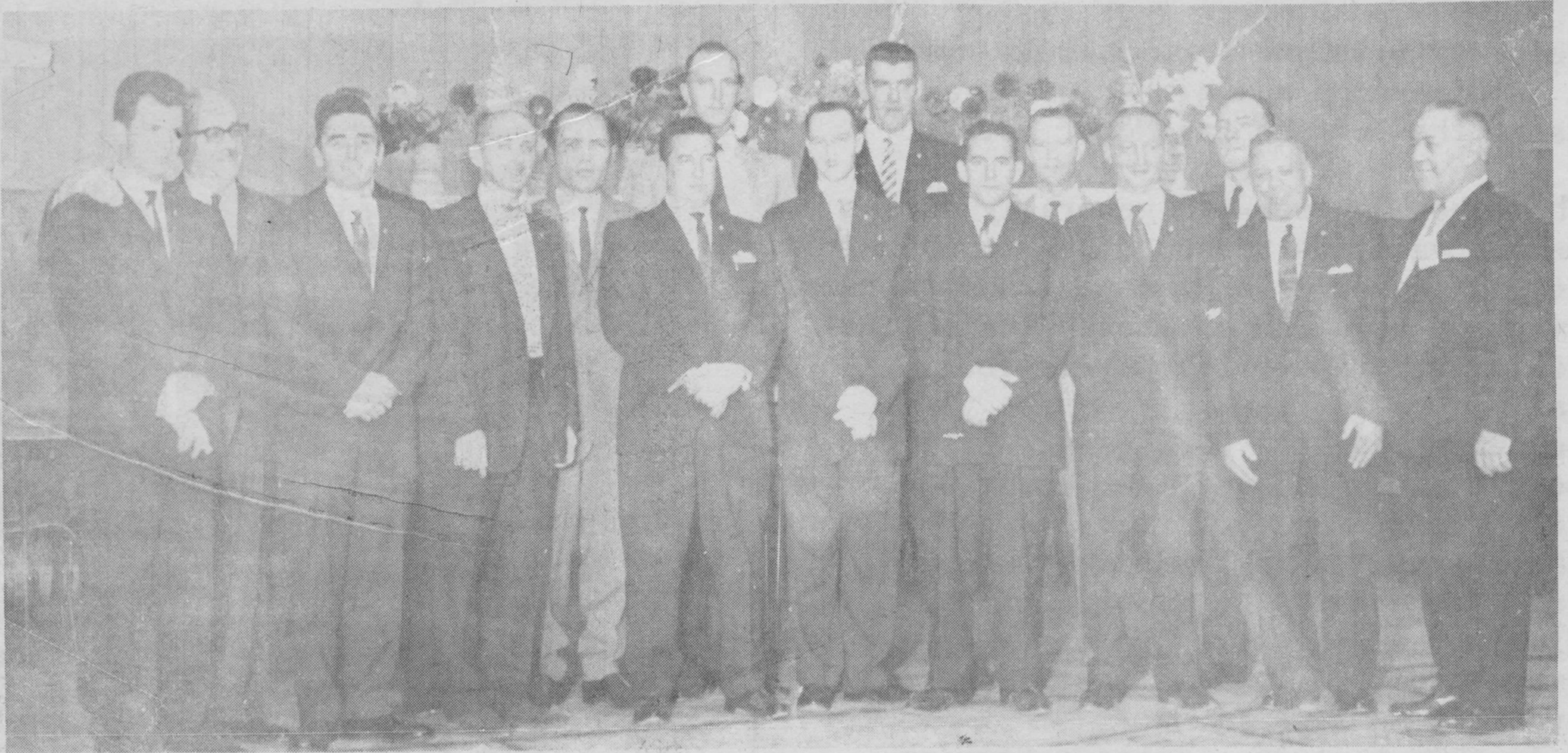
14 New Members to be were initiated into the Moose Lodge