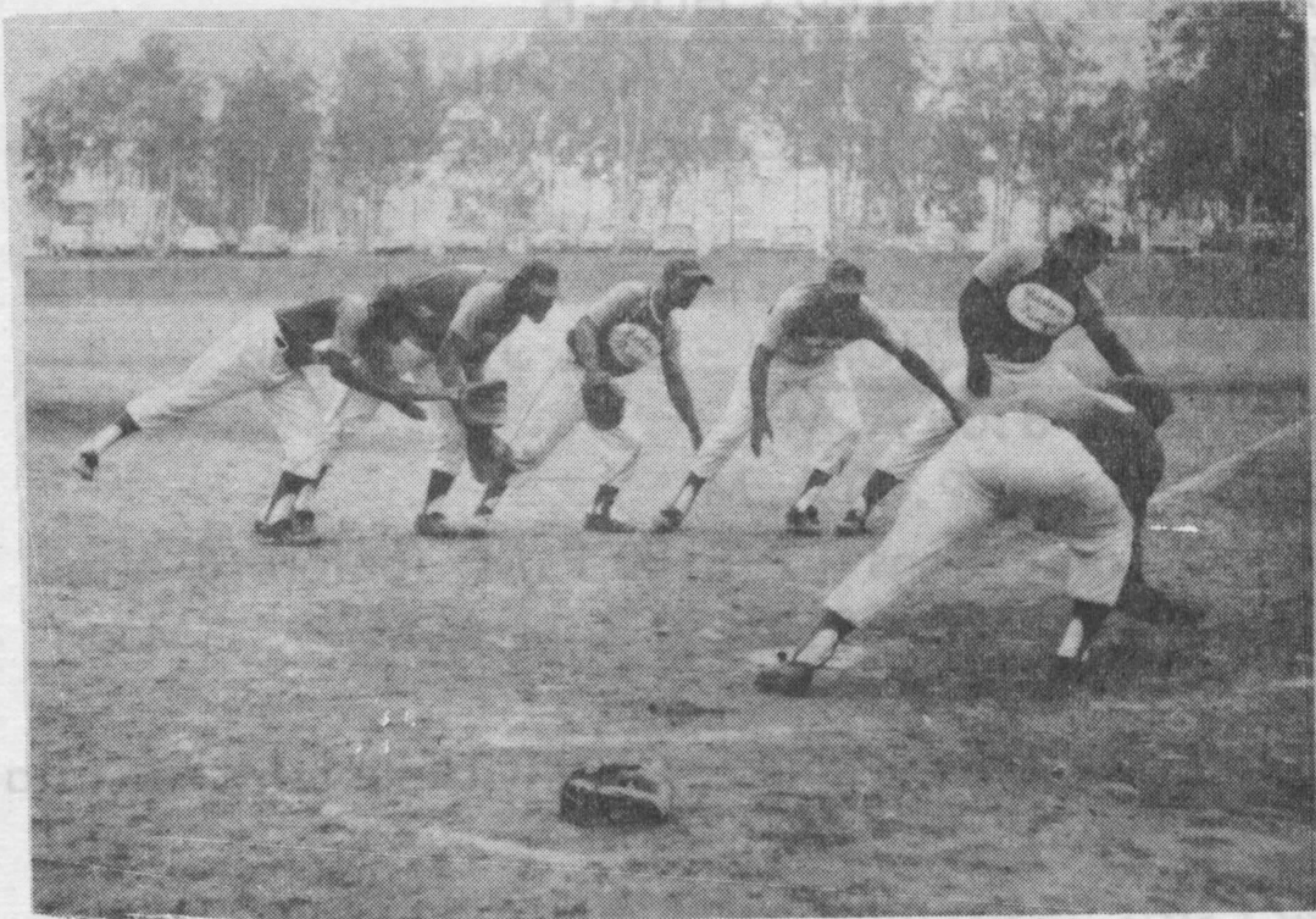
Syncopated ballcatching as demonstrated by some of Cowboy Buckner's fastball players last Friday night.