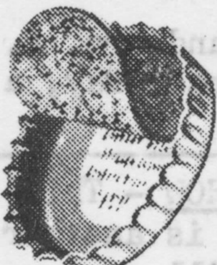
*TOTAL VALUE OF ALL PRIZES

AFTER YOUR TOUR, YOU WILL RETURN TO PARIS FOR YOUR FLIGHT HOME... AND YOUR CARAVELLE WILL BE SHIPPED RIGHT TO YOUR OWN DRIVEWAY, COMPLETELY FREE OF CHARGE!