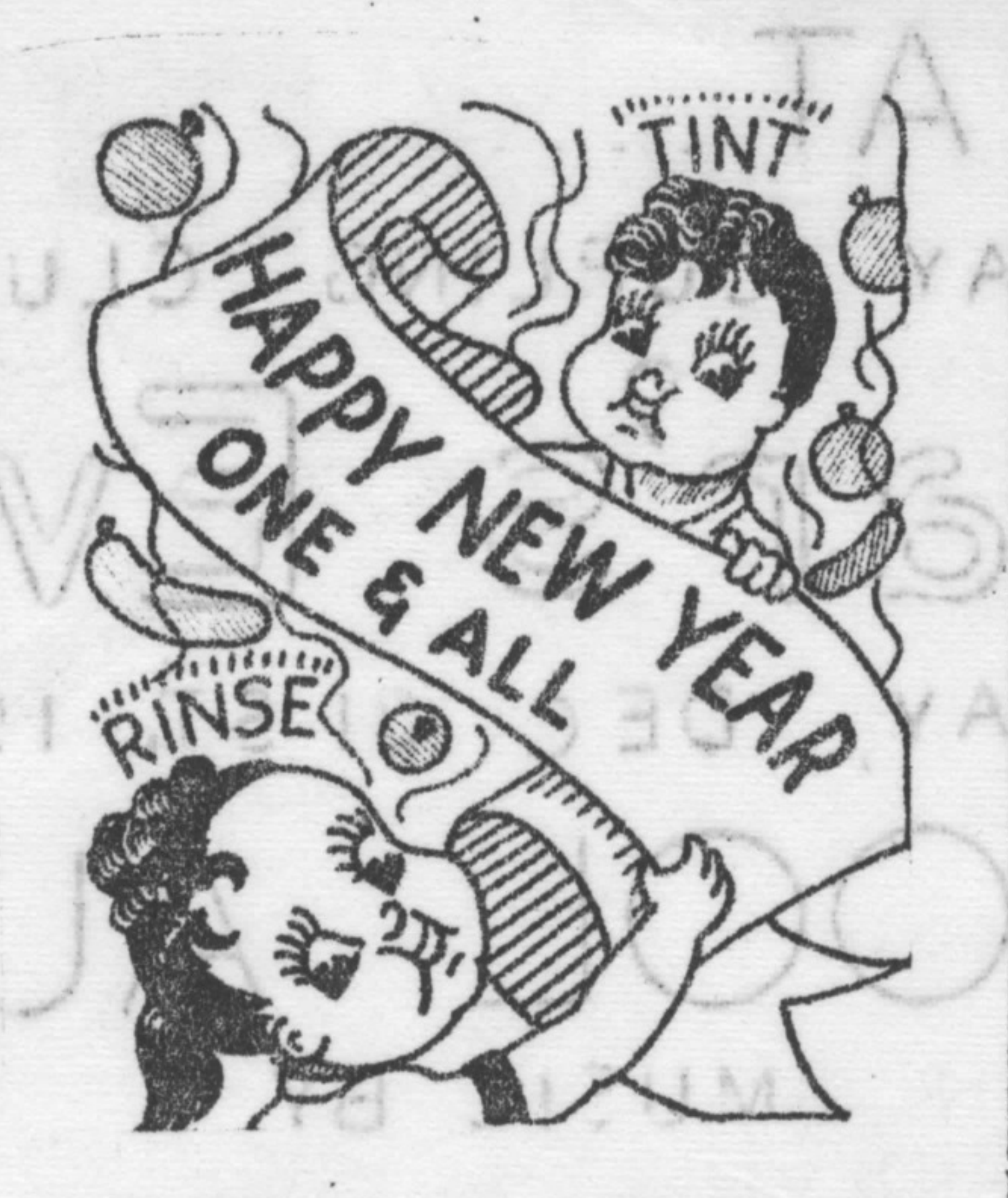
****** BEAUTY & BARBER SHOP