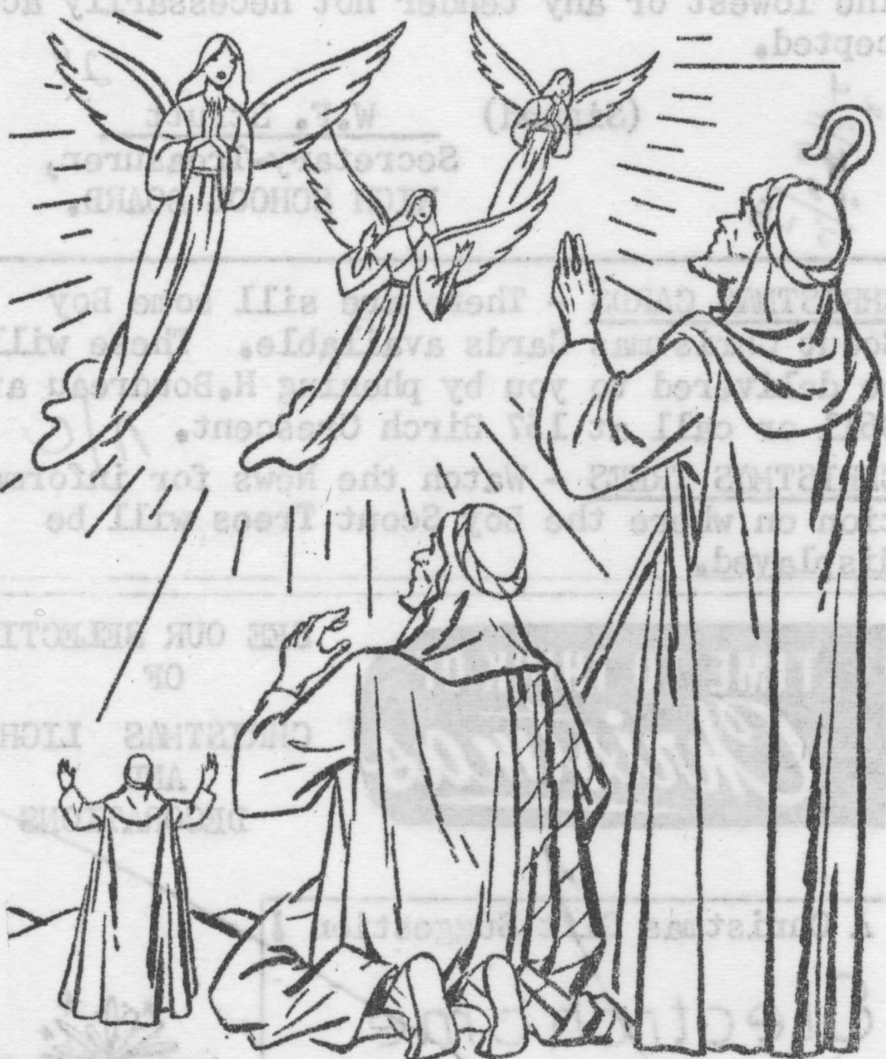
5. "A multitude of the heavenly host praising God and saying . . . 'Glory to God on the highest, and on earth, peace, good will toward men. . .'" according to St. Luke.