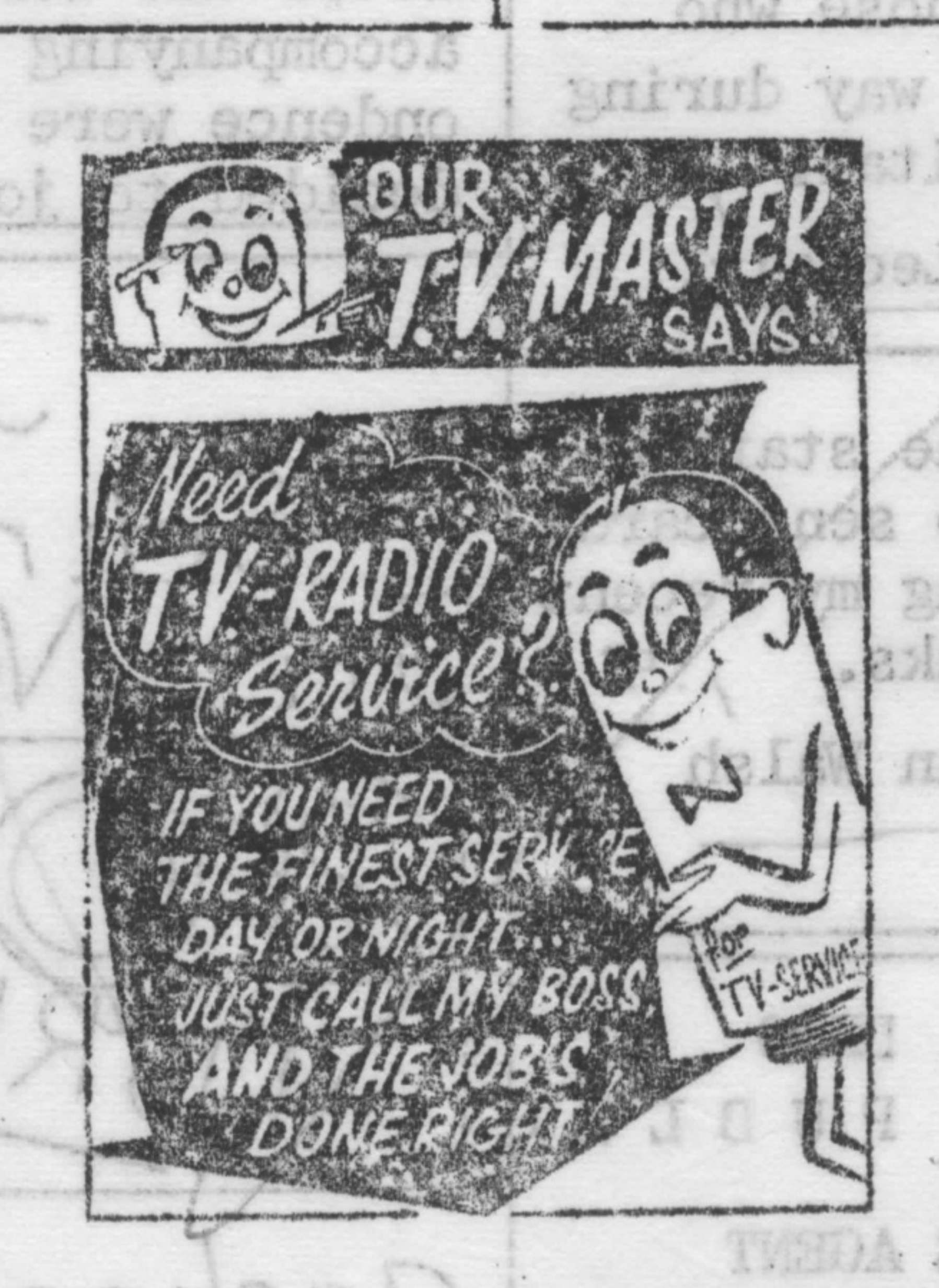
COMMUNITY T.V. SERVICES Terrace Bay, Ontario Phone TA 5-3305

lar Hospital School of Nursing, was honored at the morning Service on November 12th when