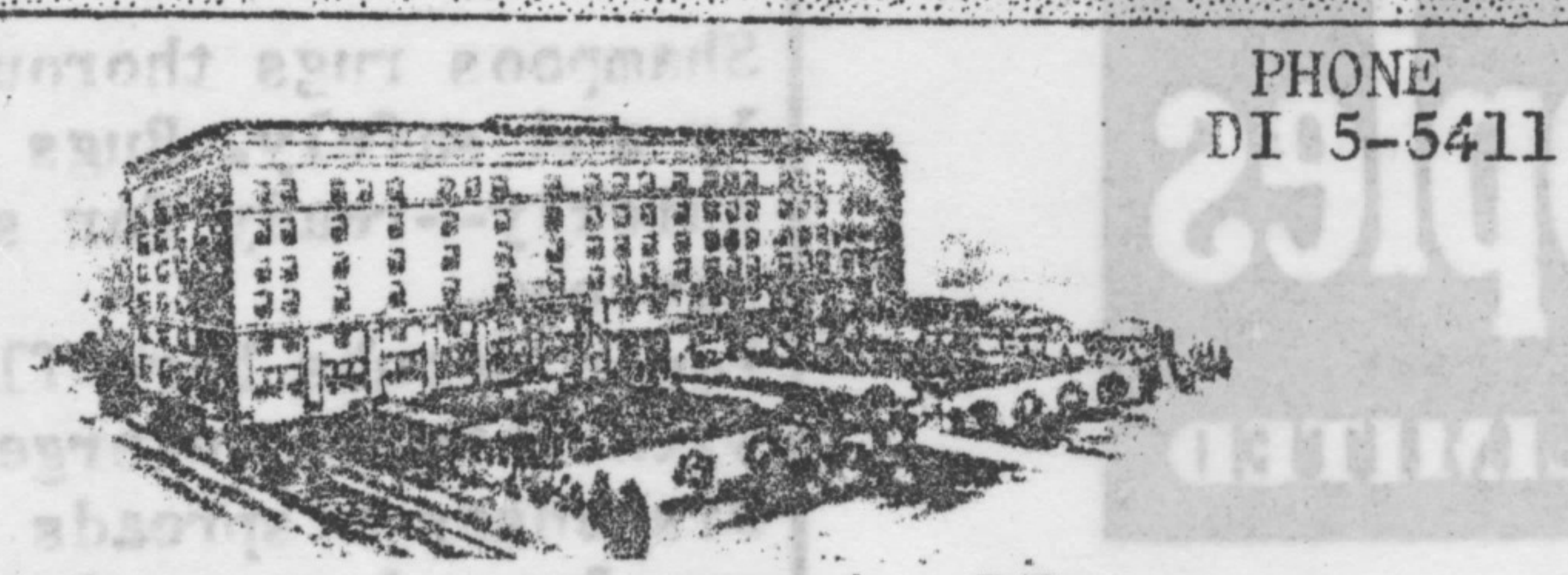
PRINCE ARTHUR HOTEI. PORT ARTHUR, ONTARIO

Success in life is not a matter of luck-it requires a great deal of steady and persistent application.