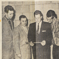
THE "SHERIFF" PLACES