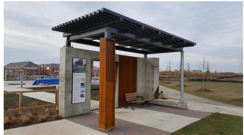
Installed in November 2016, the new plaques in Memorial Park commemorate area farming settlers in Trafalgar Township. Image: Town of Oakville.

An excerpt from the "Local Farms" plaque in Memorial Park. Image: Town of Oakville.