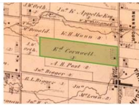
Lot allocation from 1877 Township survey, Lot 14 highlighted.