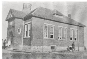
Munn's School S.S. 3A, early 20th century.

To the west of the farm, the third Munn's School was constructed in 1900. The original school for the hamlet was built on the cemetery lands on the southeast corner of Sixth Line and Dundas Street.