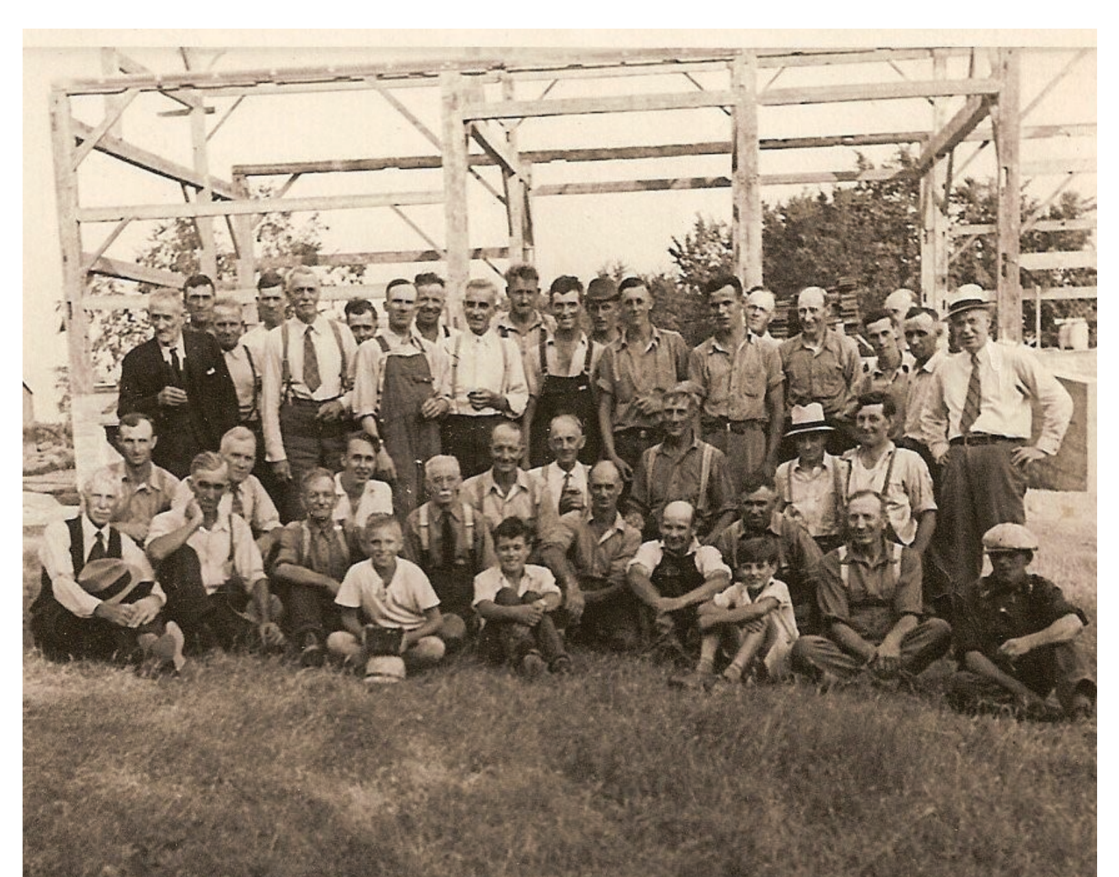
The Fleming Barn being raised, 1939.