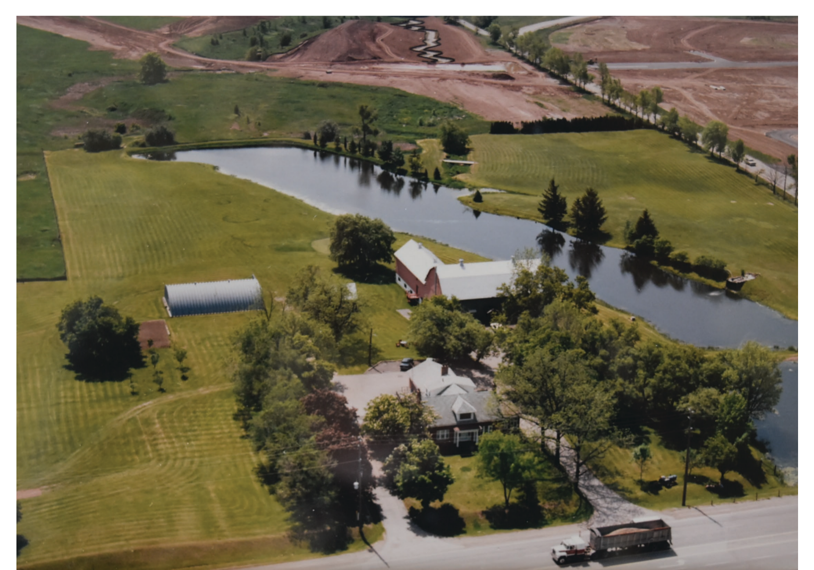
Aerial view of the farm under Hays family ownership, 1990s.