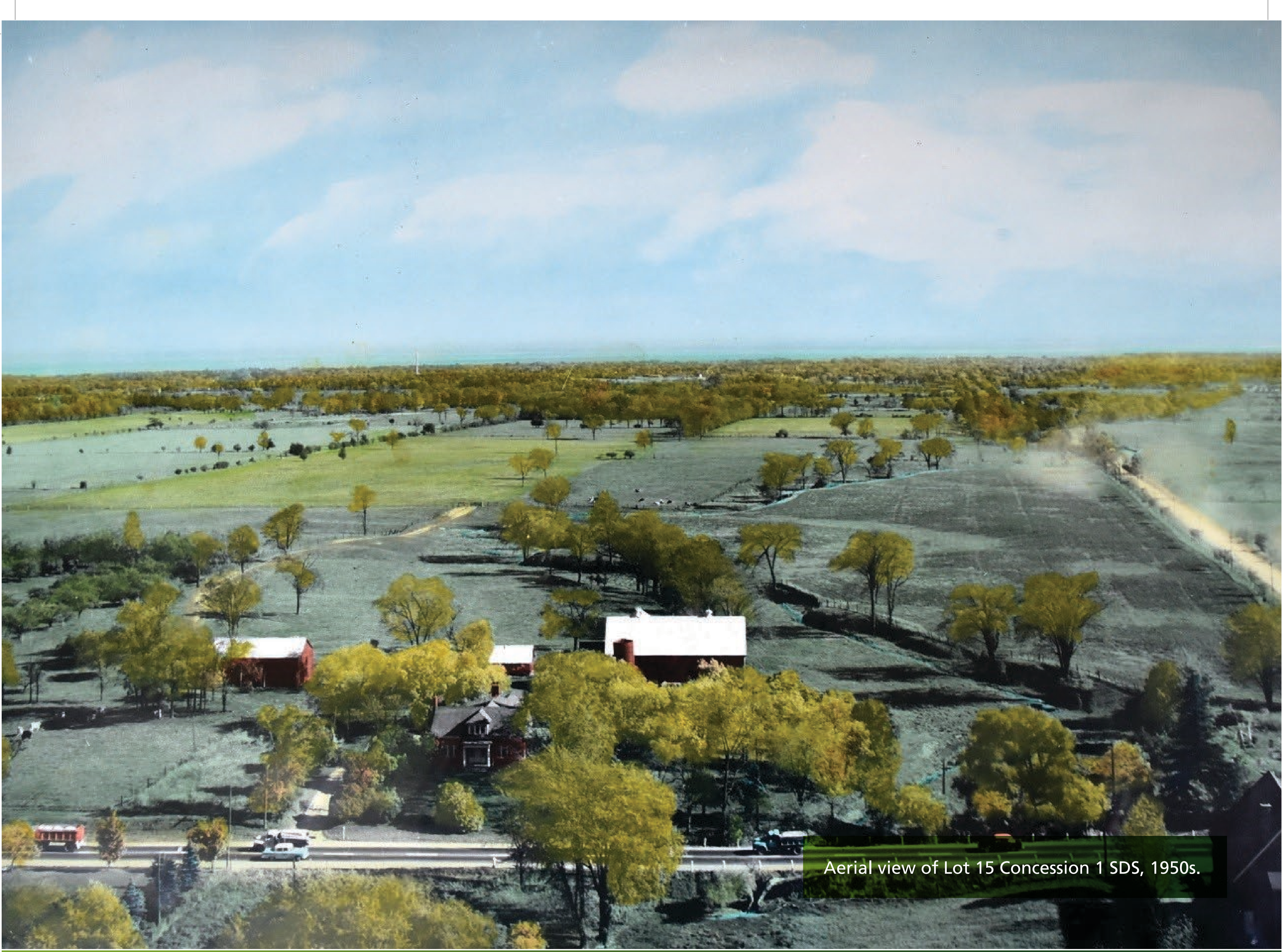
Aerial view of Lot 15 Concession 1 SDS, 1950s.