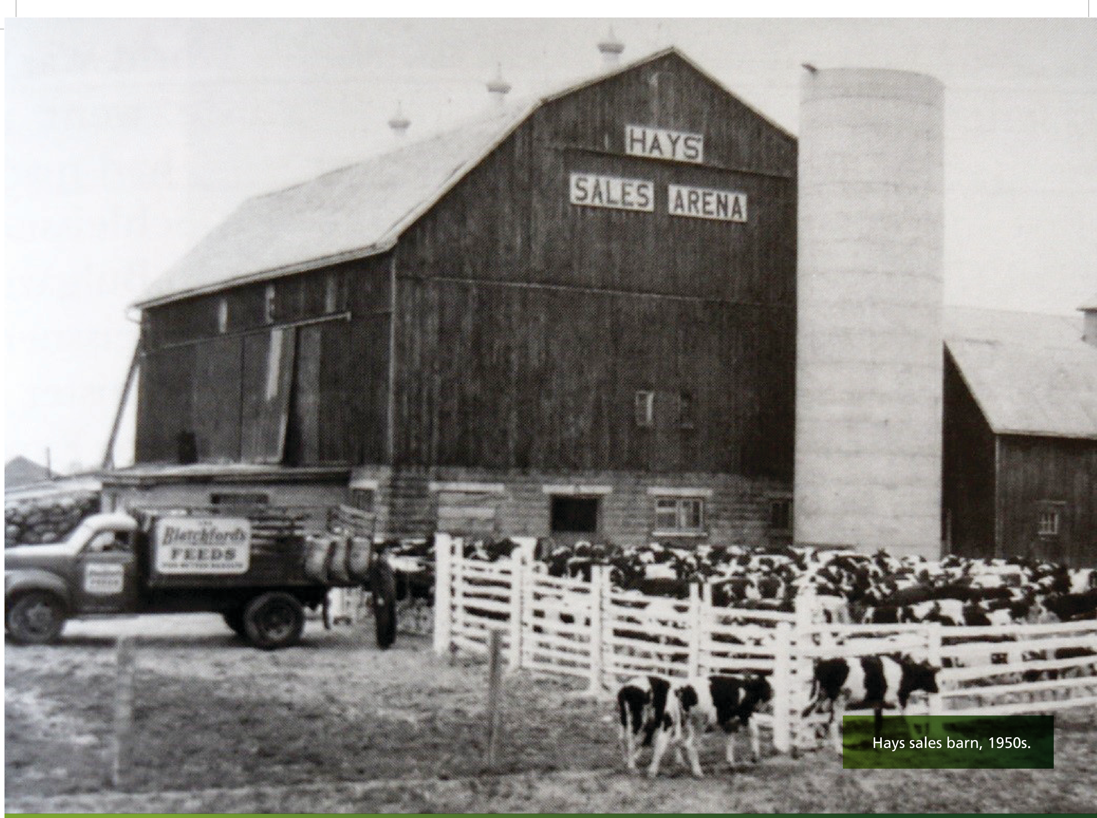
Hays sales barn, 1950s.