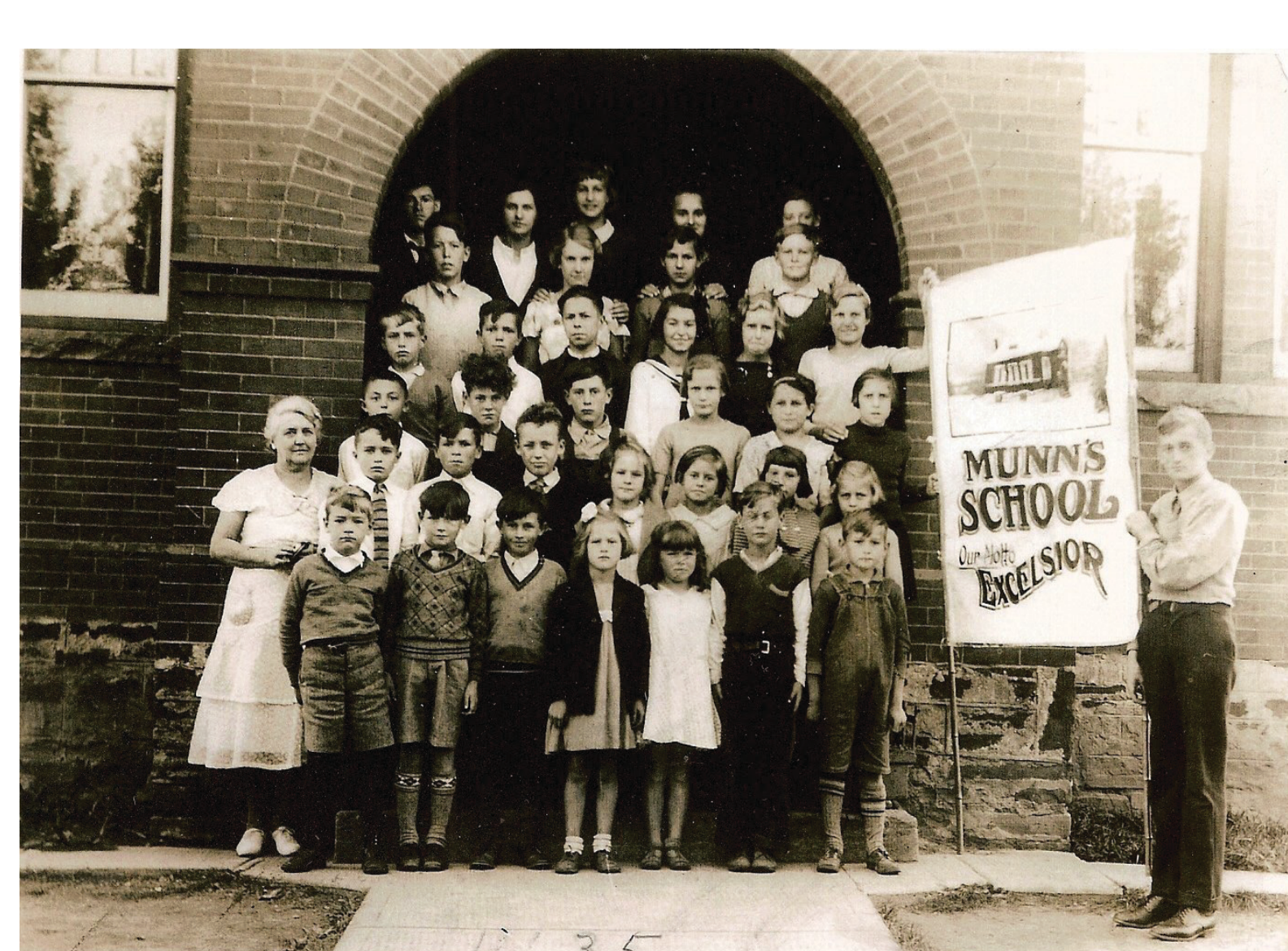
Munn's School graduating class of 1935.

Visit oakville.ca and search "heritage and history" to learn more about the history of Oakville.