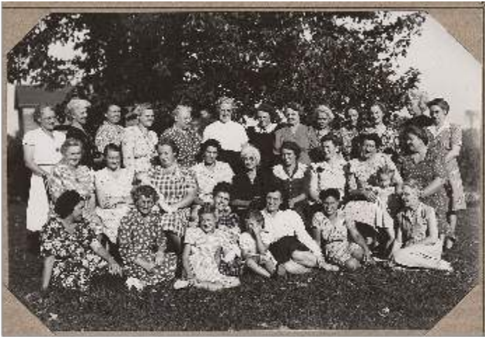
North Trafalgar Community Club, 1946