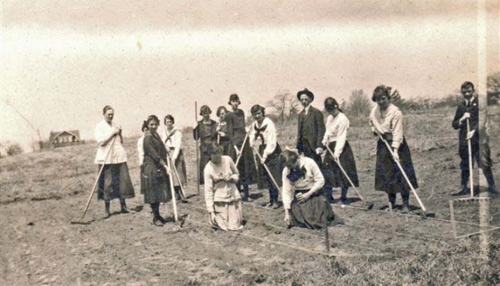
Garden behind Schoolhouse - either Palermo or Tansley School