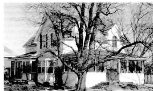
1297 Dundas Street East (North side near Ninth Line)