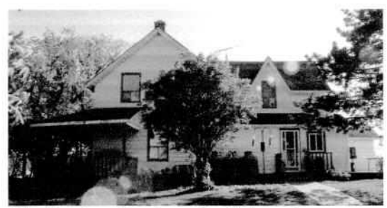
87 Dundas Street East- Near Sixth Line, just east of Munn's