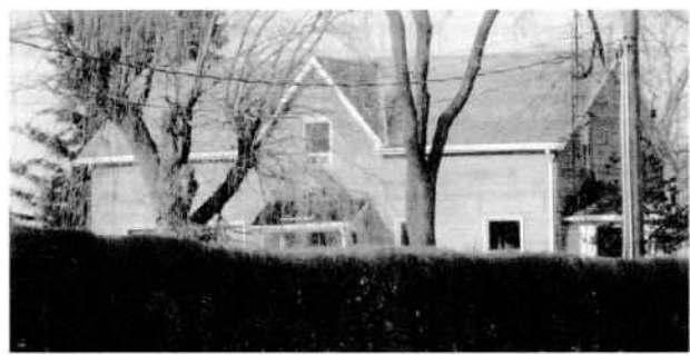
3269 Dundas Street West (North Side, W of Bronte)