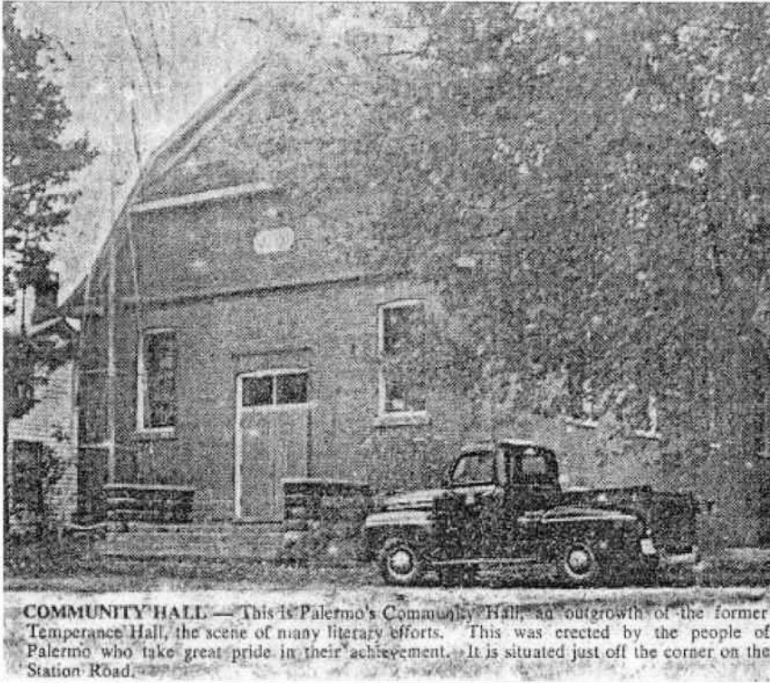
COMMUNITY HALL — This is Palermo's Community Hall, an outgrowth of the former Temperance Hall, the scene of many literary efforts. This was erected by the people of Palermo who take great pride in their achievement. It is situated just off the corner on the Station Road.

From Canadian Champion dated January 9, 1913