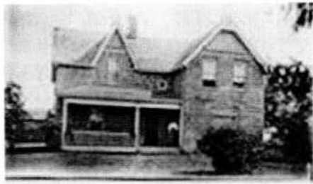
Wilsormhouse - 1930