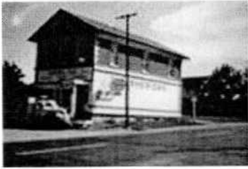
Sheridan Store - 1950