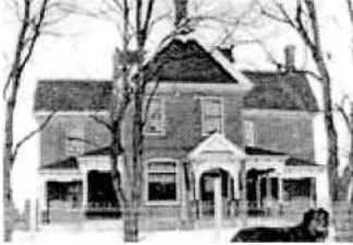
Oughtred House (Mississauga Library) demolished 1939 for QEW