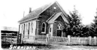
Sheridan Methodist Church c1910