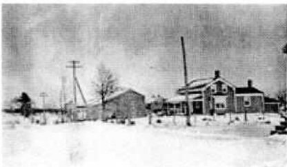
Hardy House in Sheridan - 1914

In 1877, Sheridan's reached its highpoint with a population of 100. With the widening of roads and the building of the QEW much of Sheridan was demolished. Today all that remains is the Sheridan cairn hat was constructed in 1986 and the silo beside it..