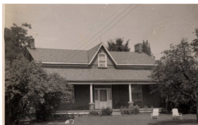
Gail Cherrington brought this one of the Kaitting House which was later owned by the Kings and called Kingholm farm 1953

We had a successful scanning day with 9 people coming out. We don't have everything uploaded to the site yet but will get to that after the Fall Fair is done. We currently have a back log of about 200 photos to upload. Feel free to submit photos to us on a disk and we can have them uploaded to Oakville Images. The photos must be 600 DPI, colour, and saved as a TIFF file using the correct naming convention which is TTOI (TTOI for Trafalgar Township Oakville Images) and then the initials of your name and then the number of the photo starting with 001. Below are two of the photos we scanned.