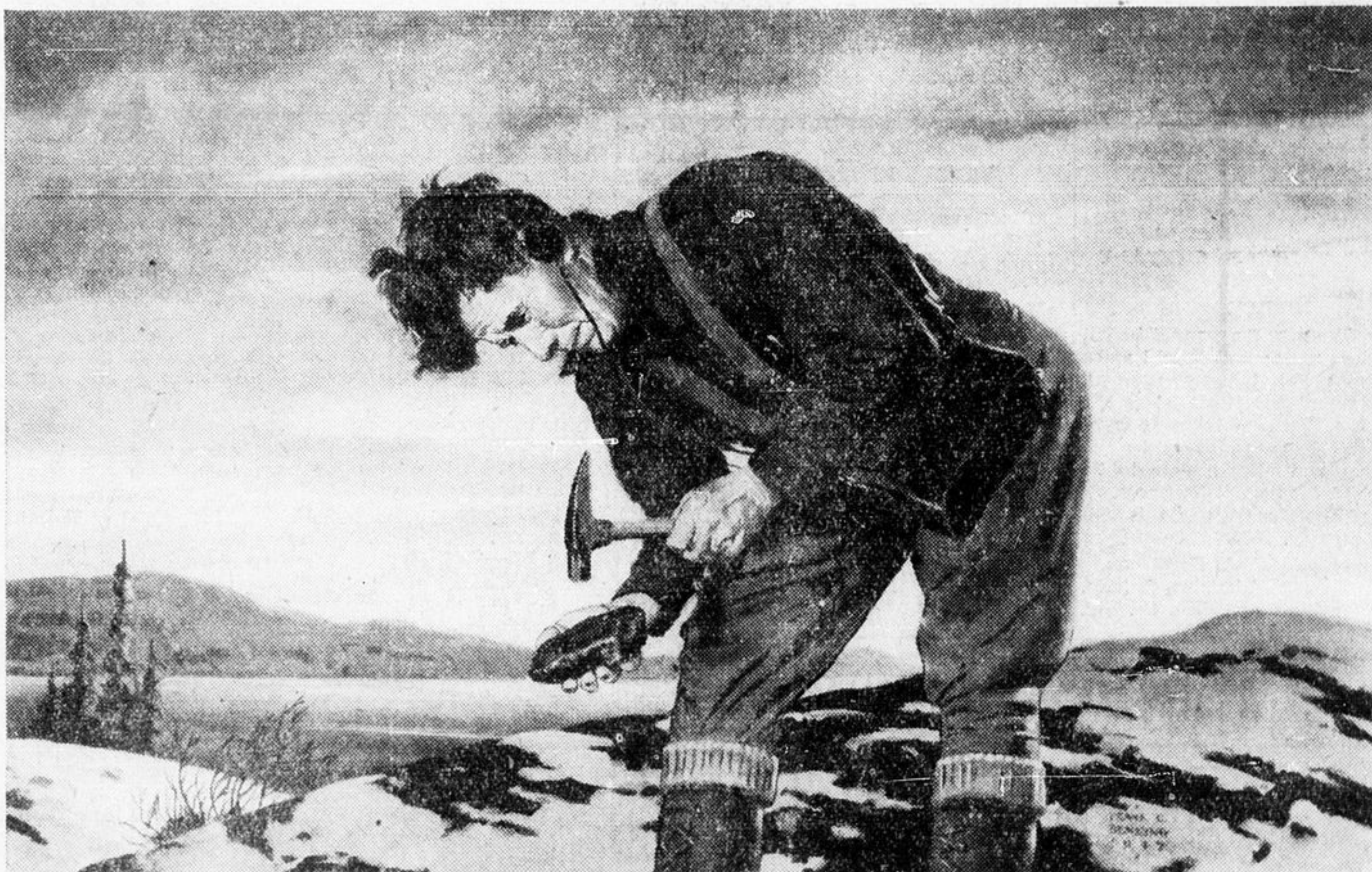
No chemical element is so precious as Radium—none more effective in combating many diseases. It is Canada's distinction to be one of the world's chief sources of Radium—her pride that, through it, she helps relieve the sufferings of mankind.