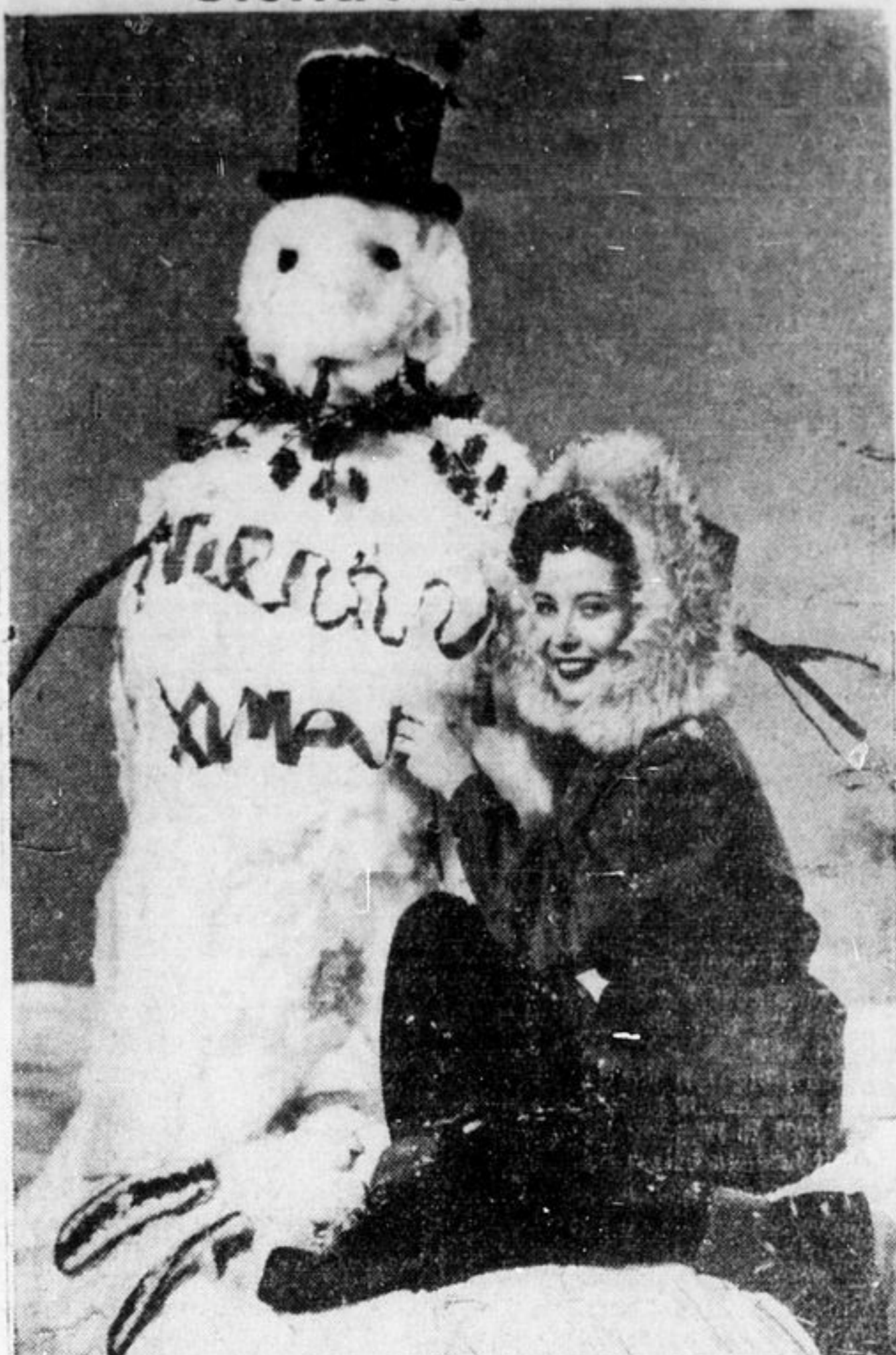
LOVELY GLORIA DE HAVEN has her own Santa Claus for the Yuletide season this year. The young M-G-M actress recently completed roles in "Scene of the Crime" and "The Doctor and the Girl."