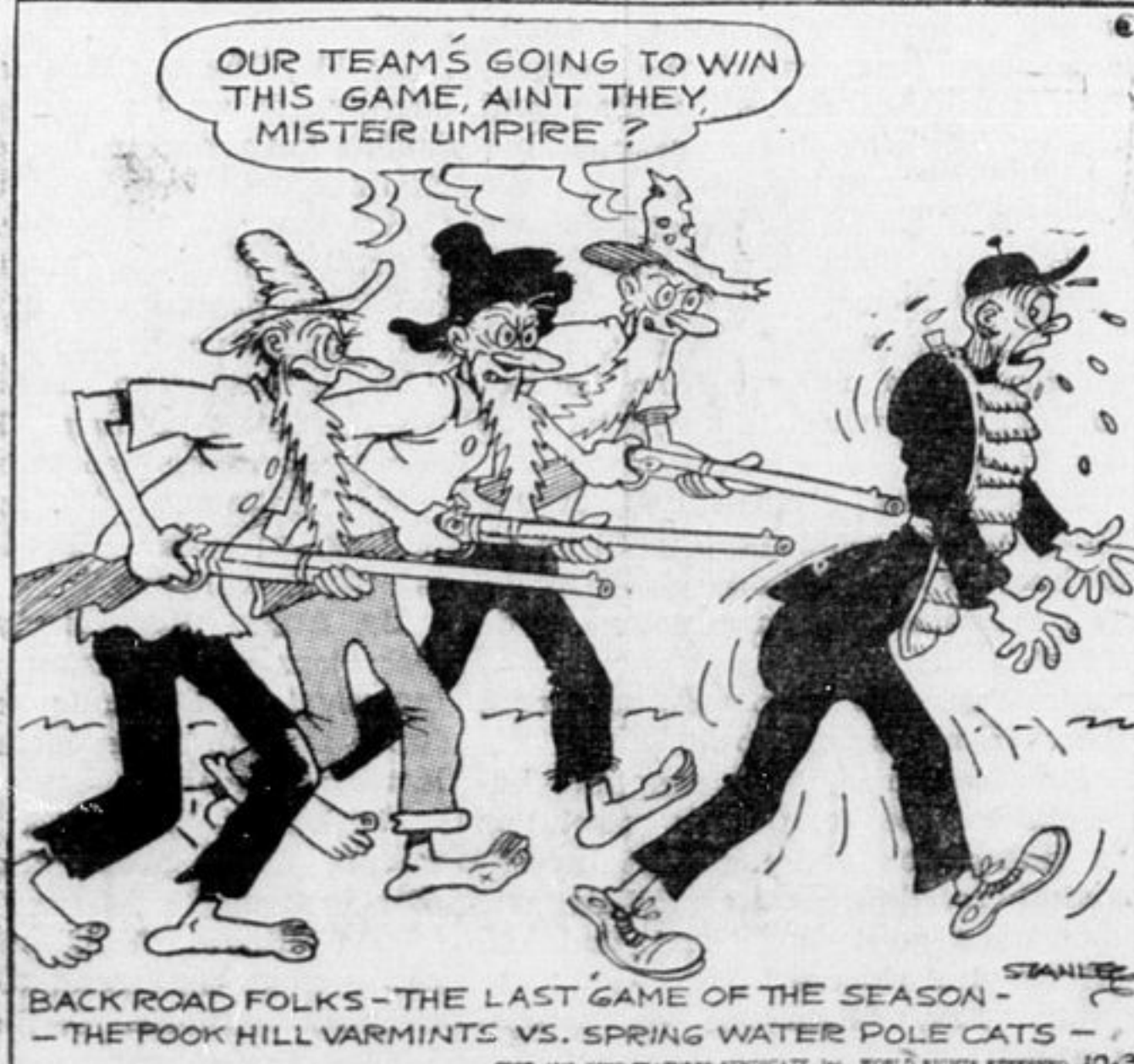
BACK ROAD FOLKS - THE LAST GAME OF THE SEASON - THE POKK HILL VARMINTS VS. SPRING WATER POLE CATS