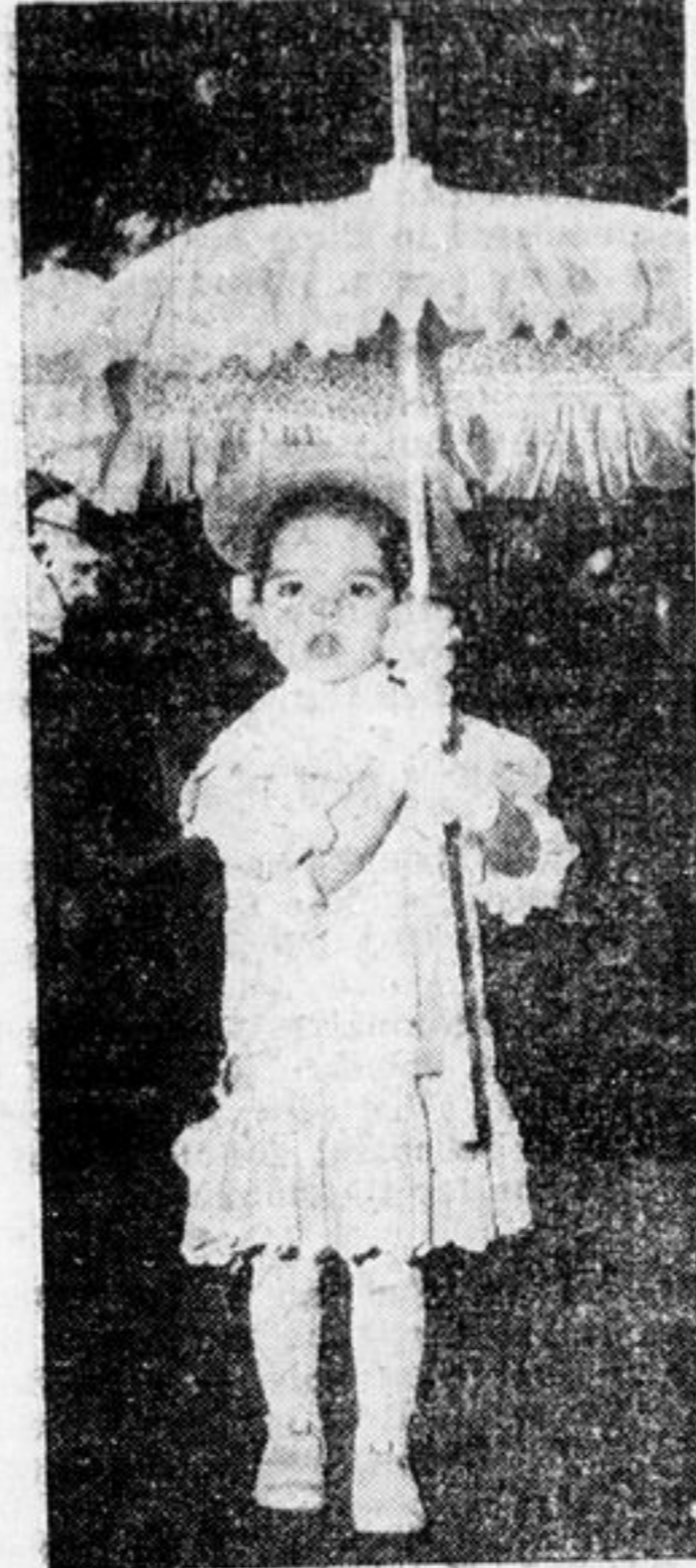
LIZA MINNELLI, two and a half year old daughter of Judy Garland and Vincente Minnelli, makes her film debut six months earlier than her famous mother. In "In The Good Old Summer-time," Liza appears as her mother's daughter, with Van Johnson as her screen father.