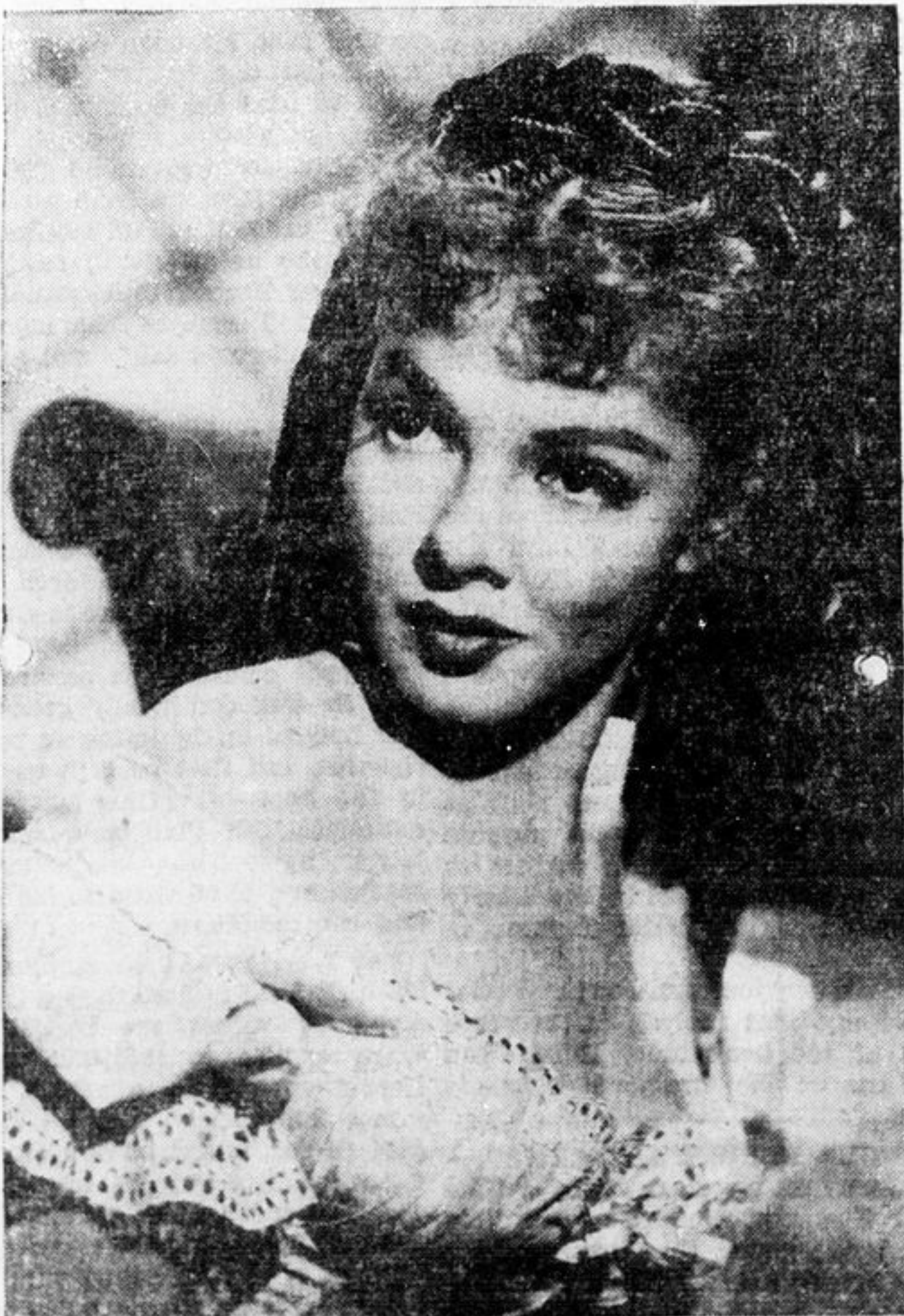
KATHRYN GRAYSON, singing star for M-G-M, will grace still another Technicolor musical when she appears in the forthcoming film, "The Kissing Bandit," opposite another famed voice—Frank Sinatra.