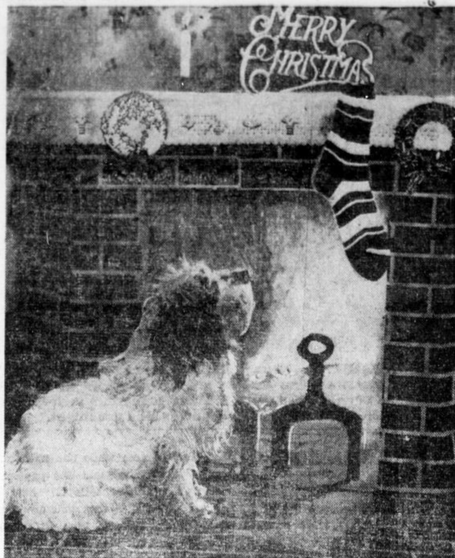
ROVER WAITS FOR CHRISTMAS . . . He knows that Santa is not going to fall him, and that before long the genial saint will drop down the chimney and leave presents for all good boys, girls and dogs.

39 Third Avenue, Timmins Phone 285 & 286