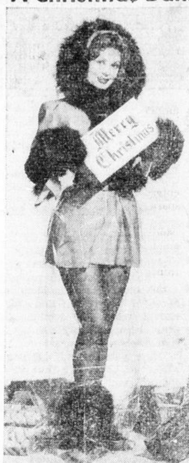
WRAPPED IN CELLOPHANE, Arlene Dahl is the spirit of yuletide and ready for delivery. The beautiful Arlene is currently to be seen playing opposite Red Skelton in Metro-Goldwyn-Mayer's riotous comedy, "A Southern Yankee."

I don't know how you feel about it, but in our family we would rather get a Christmas card that shows the results of children and parents' ideas of Yule-tide greetings than to receive the fanciest and most expensive product of the greeting card manufacturer. Perhaps your friends feel the same way. It's worth a try to find out, at any rate. And what fun everyone can have developing ideas for home-grown greetings! Older youngsters may be able to make linoleum block cuts with a little help from teachers or parents who can show them how to use linoleum-cutting tools. Christmas trees aren't too hard o sketent. Pictures of simple toys under the tree can be made quite effectively, too. Younger children can cut out circles of colored paper and paste them on a card. The popular magazines furnish all sorts of attractive pictures fairly crying out to be used. Parents and children together can decide what sort of photos of the family would have a Christmas touch and each can write a brief message to special friends on the back of such photos. These, indeed, are but a few of the ideas that can be used to bring our own particular brand of Christmas greetings to friends and relatives. Family discussion as to possibilities will probably bring out a great many others.