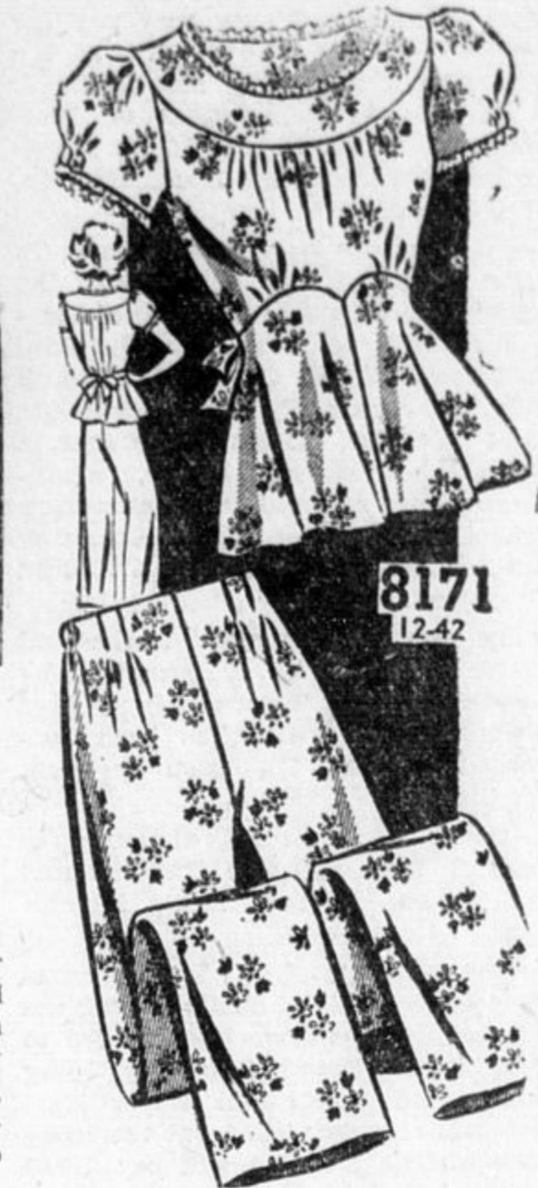
Pattern No. 8171 is for sizes 12, 14, 16, 18, 20, 40 and 42. Size 14, 4 1/2 yards of 35 or 39-inch; 1 yard purchased ruffling.

You're sure to feel glamorous in these gayly flowered pajamas. The youthful round neck is edged in tiny ruffling and matches the perky puffed sleeves.