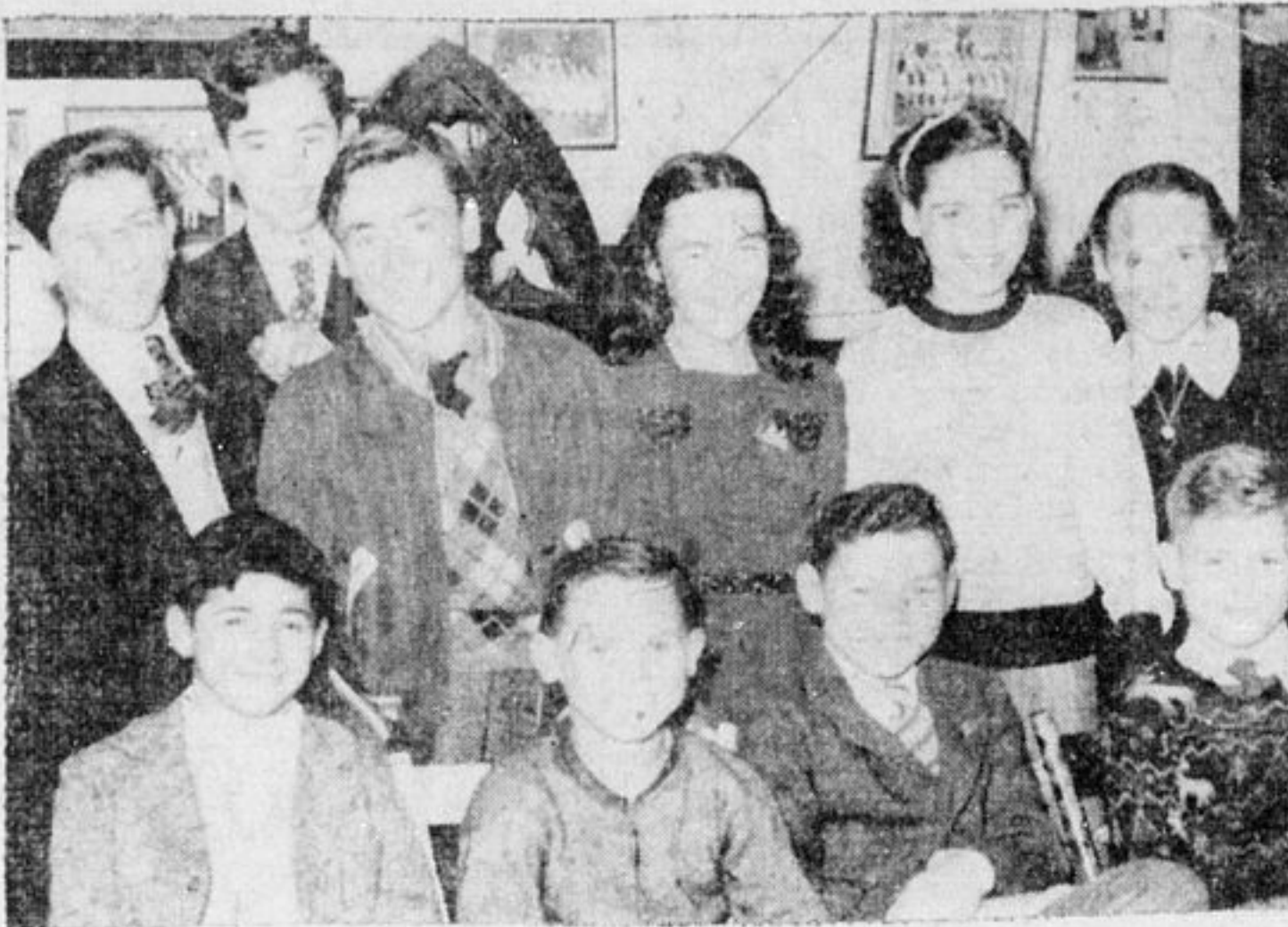
Some of the principals in a gay party held by The Women of the Moose, Chapter 303, on Monday evening are this happy bunch of 'teen-agers' who are the sons and daughters of members of the local chapter.