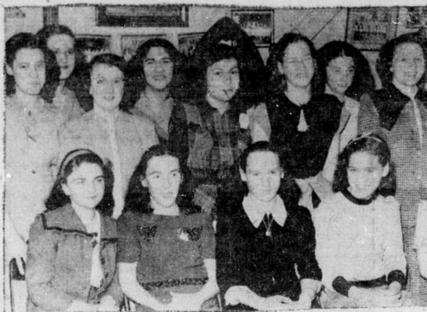
Smiling gaily for the Advance cameraman are these 'teen-agers' who were among the many attending the merry Christmas party sponsored by the local chapter of The Loyal Order of the Moose.