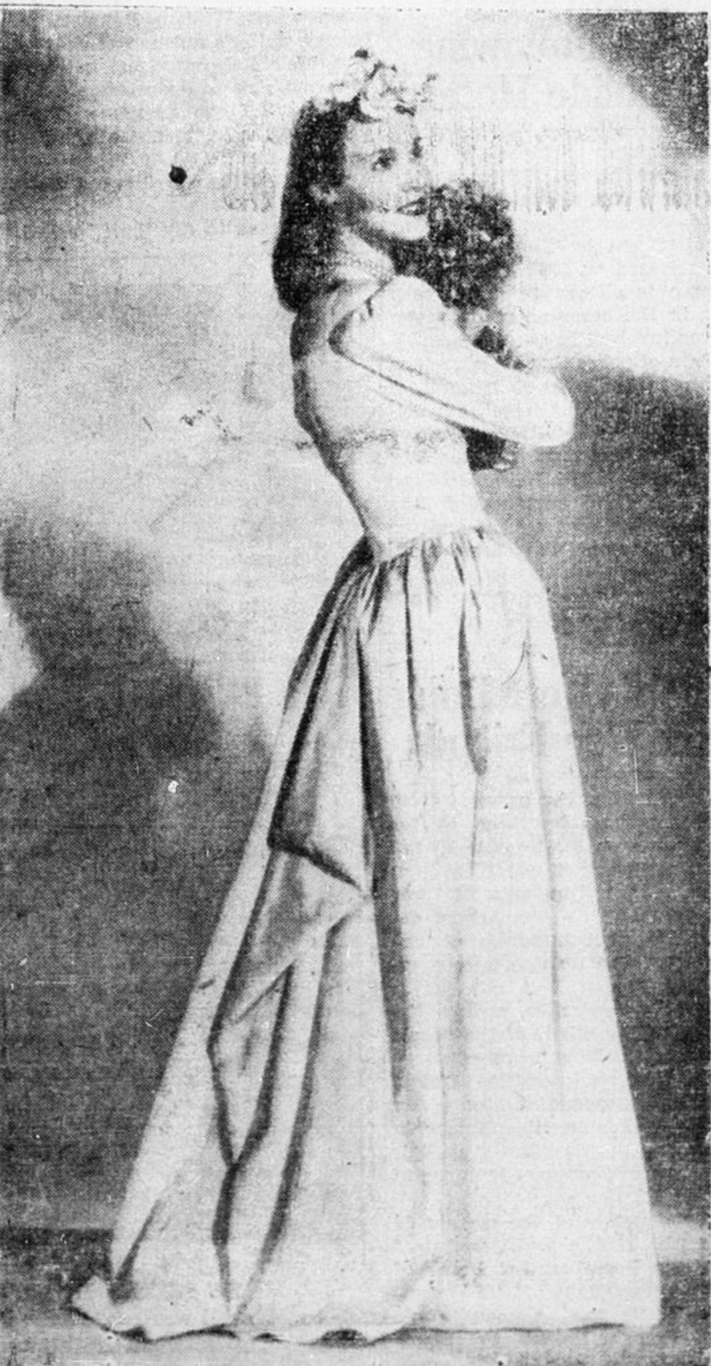
Many a bridesmaid becomes a bride, bouquet, being in that lady's good contrary to the glib phrase which says "often a bridesmaid but never a wedding bride" . . . due to two fortuitous, vocational opportunities. One: She always has a pretty dress. Two: She has the best chance of catching the bride's