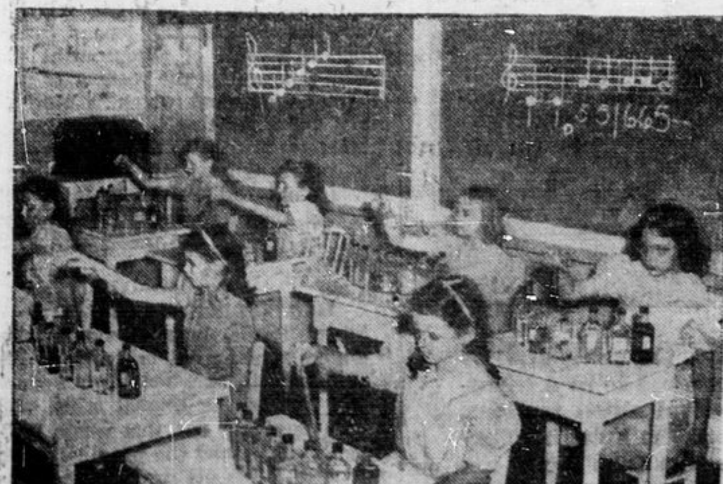
SHORTHAND MUSIC... At music class in session at St. Mary's Hall, school for girls at Burlington, N. J. They learn music by tapping bottles filled with various levels with water. Accompanied by the piano, these youngsters learn to tap the bottles. Each bottle carries the name of the note of the scale.

And here are a few wee ideas about wrapping those Christmas gifts, after you've lugged them home. Use your imagination this year--do something different than the conventional red-tissue-and-green-ribbon. The wallpaper store near you will likely have pretty pieces left that you can buy for a song--alright, for very little money if the man doesn't like songs. Wrap your gifts in this gay paper--fasten 'em with clear color-less Scotch tape--and decorate them with a cluster of holly in one corner. Unusual and very attractive--that's the parcel. Smart and complimented--that's you.