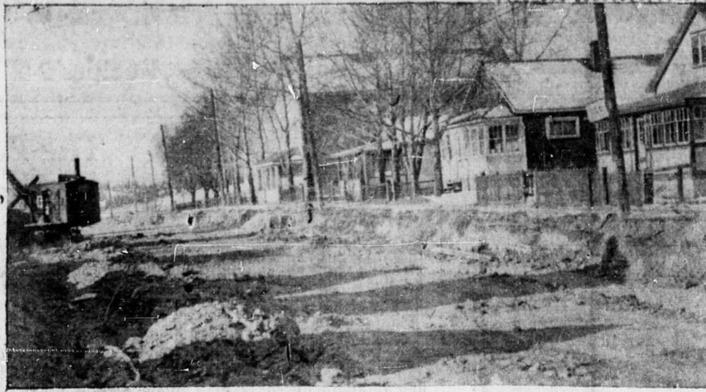
Due to the type of clay on which the town of South Porcupine is built, it is a costly proposition to build good roads in the community. First several feet of topsoil must be removed. Then backfill of sand and mine rock must be made. However, the municipality will have a system of first-class streets through its business section when the above portion of road is completed. It is part of Bruce street. Backfill is being put in this week and paving in this section will be done next Summer.