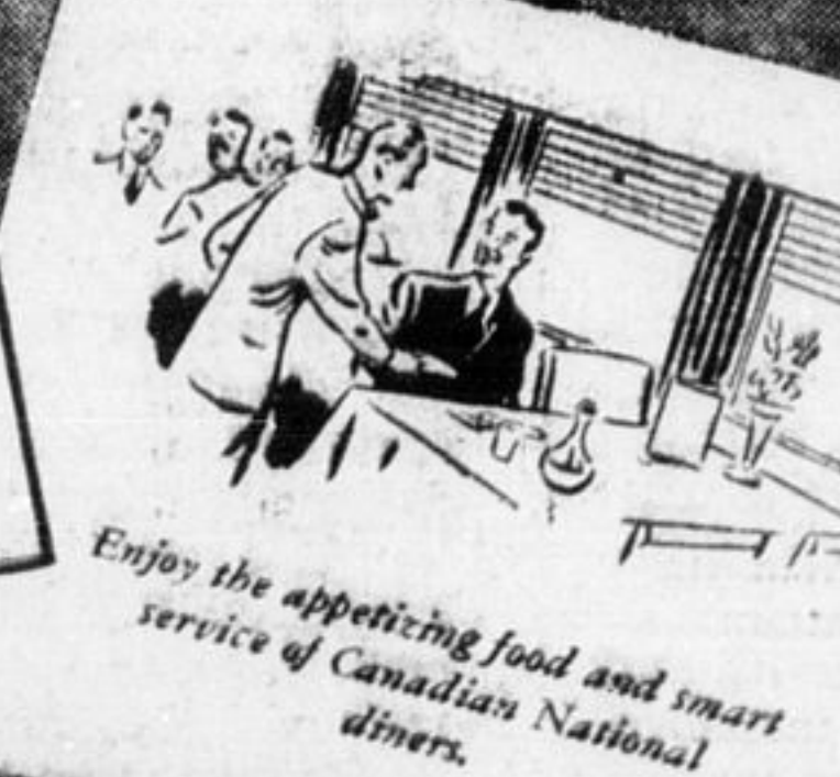
Enjoy the appetizing food and smart service of Canadian National diners.

CANADIAN NATIONAL THE RAILWAY TO EVERYWHERE IN CANADA