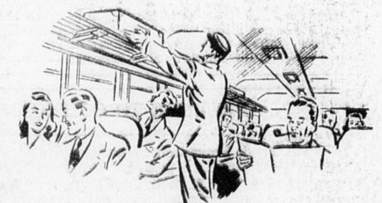
Well-trained porters help to make your trip pleasant.

Whichever you choose, you'll enjoy your train trip by Canadian National Railways.