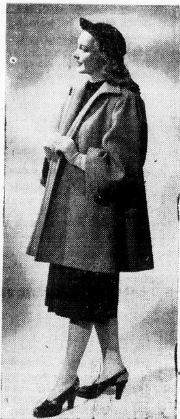
Spring Toppers Feature Fullness