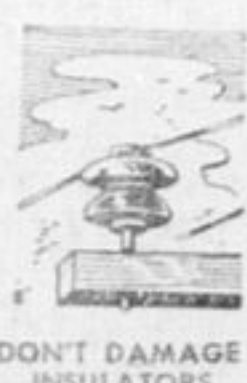
DON'T DAMAGE INSULATORS

THE HYDRO-ELECTRIC POWER COMMISSION OF ONTARIO