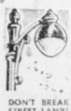
DON'T BREAK STREET LAMPS

Please use your influence at every opportunity to prevent the deliberate or careless destruction of public property.