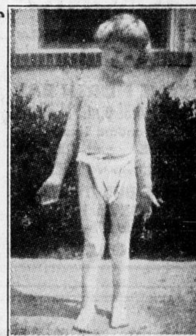
AFTER treatment -- a happy, healthy child.

Any information given will be treated as confidential and will not obligate you further.