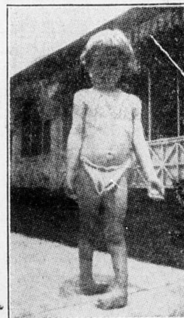
BEFORE receiving treatment.

The Kiwanis Club of Timmins would like to know the name, address and nature of disability of any crippled child.