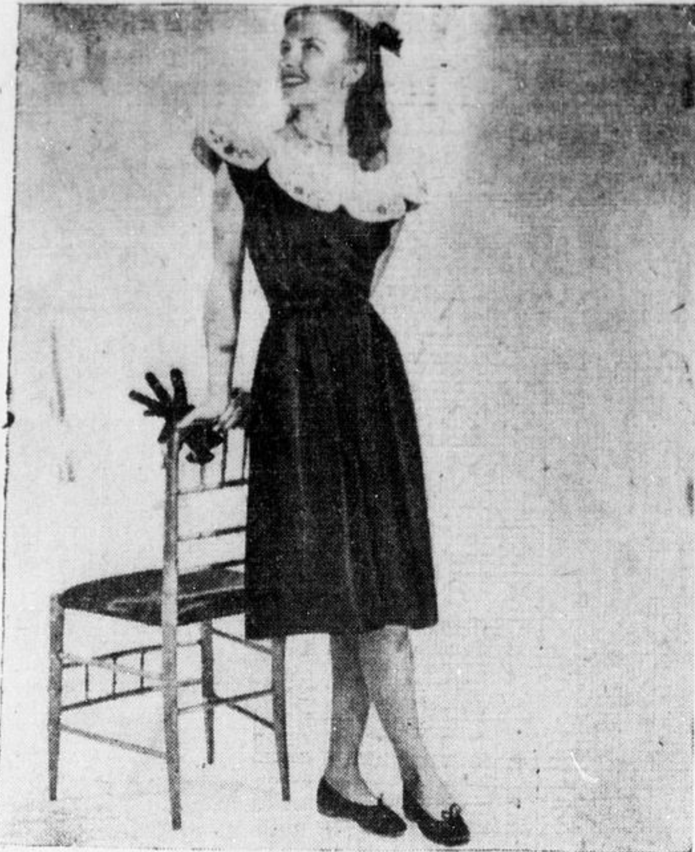
BY PRUNELLA WOOD

A very pretty date dress which looks very special, but which is easy to wear and take care of, is this black crepe model, trimmed with a pale pink satin berthia collar.