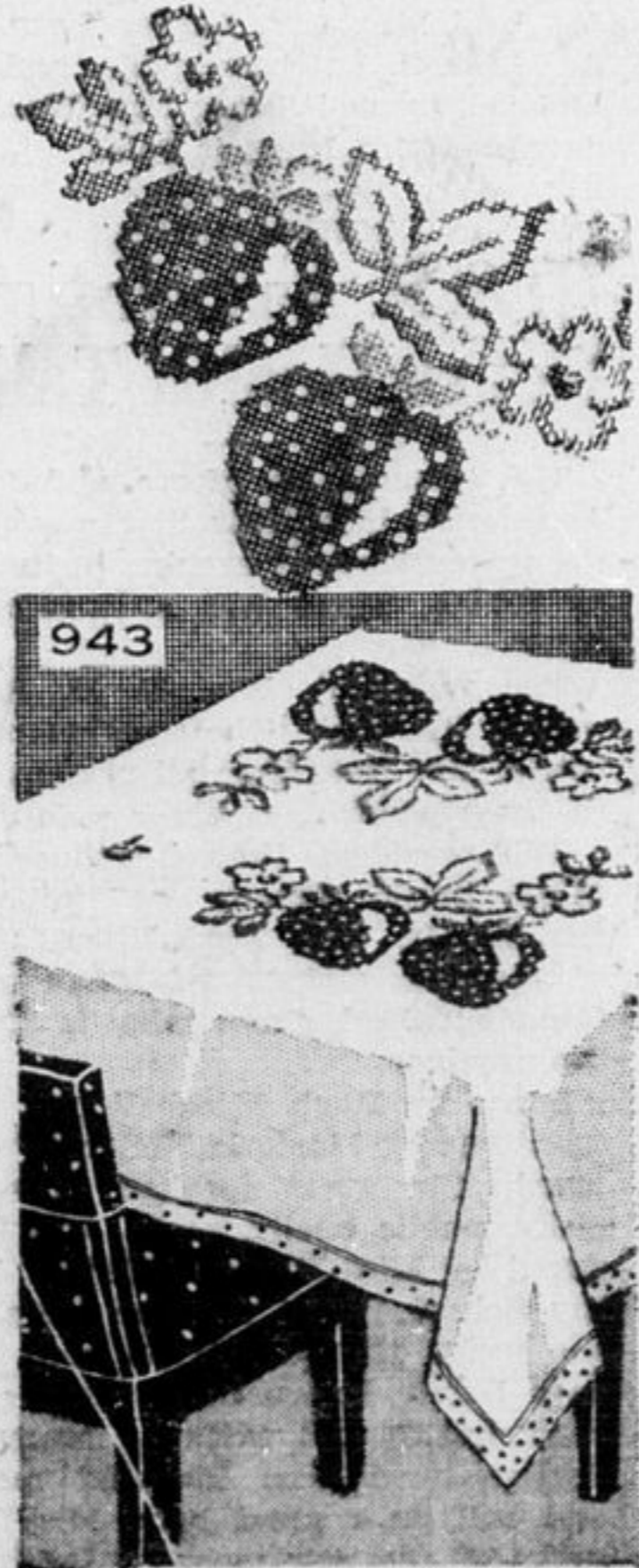
By Laura Wheeler

Large and small crosses make these giant strawberries grow quickly for expert or beginner. Colorful, easy way to pep up lines.