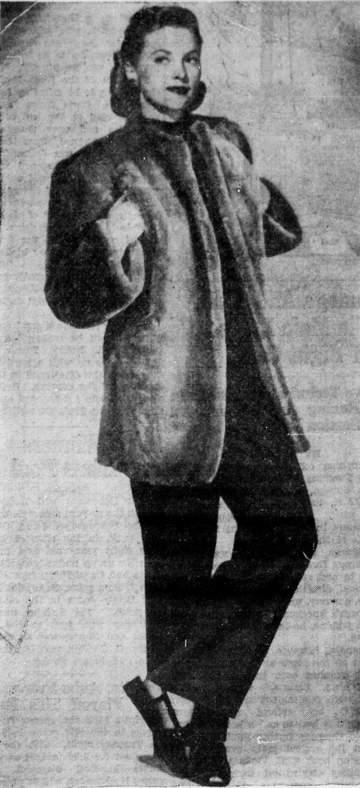
BY PRUNELLA WOOD

MARY'S famous little lamb is an ordinary, woolly white creature to have got so much publicity. You should see the new sheared and extra-supple lambs wools of 1946, called bonmouton, to appreciate the difference. They are dyed as gently as Easter eggs, or seed catalogues, and offer a bright, new accent to the casual wardrobe. (Warm as well as bright.) The coat which Dana wears with smart black slacks and pullover, above, is dyed a giddy hunting pink, and it has real fashion value.