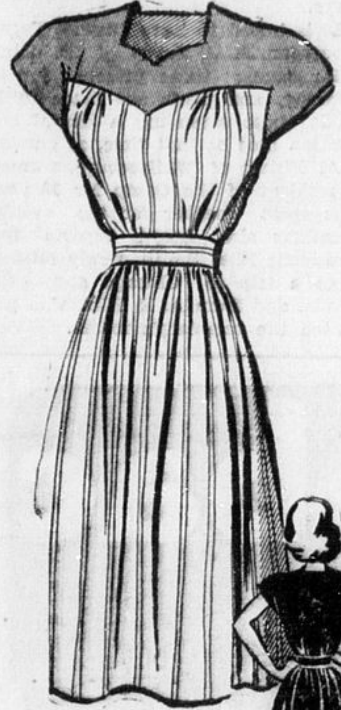
4707 SIZES 12-20

Here's flattery for you in a new yokeline dress . . . it cinches your waistline, cuts a slim figure. Pattern 4707 has no sleeves to set in . . . it's easy warm weather sewing!