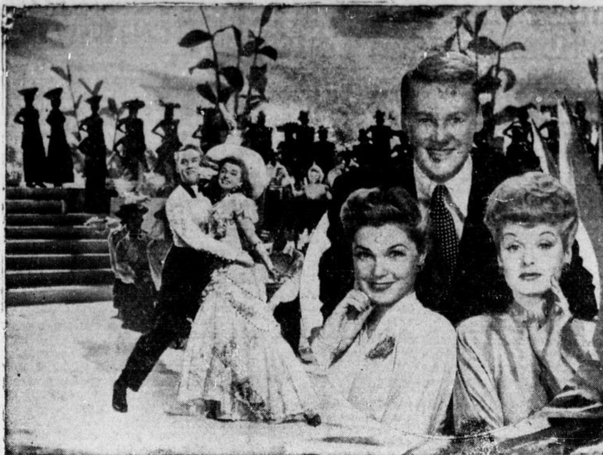
Meet Hollywood's latest song-and-dance team — Van Johnson and Esther Williams! This new MGM team does some nifty warbling and some dazzling footwork in the Technicolor musical laugh extravaganza, "Easy To Wed," opening Saturday at the Broadway Theatre. In the scene above, Van and Esther are dancing to "Bonaca de Pixe," a samba number and one of a flock of hit tunes in the picture. Lucille Ball, another member of the stellar cast of "Easy To Wed," also bursts into song to the tune of "The Continental Polka."