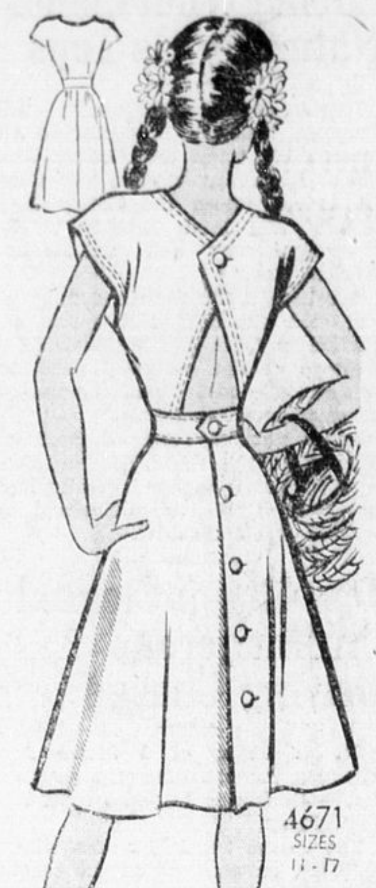
4671 SIZES 11-17 Specially "cut out" for you, Jr. Miss, this sunrock to make HIS

heart beat faster! Easy-to-make Extra: Opens flat to iron quickly. Pattern 4671 comes in Junior Miss sizes 11, 13, 15 and 17. Size 13 takes 2 1/2 yards 39-inch. Send TWENTY CENTS to The Advance, for this pattern. Print your NAME and ADDRESS , PATTERN NUMBER and SIZE clearly.