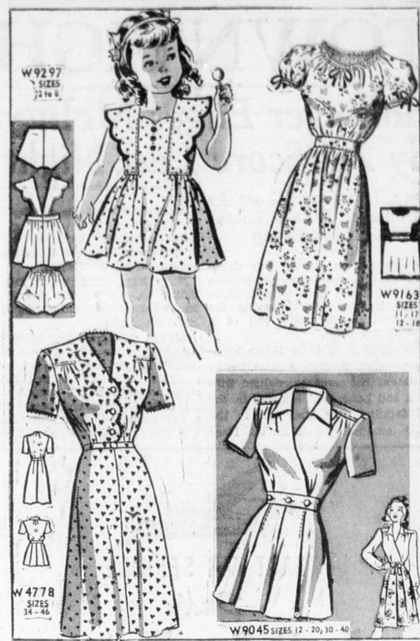
PATTERN W9297 — Cute and sweet! That's your small girl in this seamed sunfrock. Complete with its own comfortable panties. Both are simple to sew. Sizes 2, 4, 6, 8. Size 6 takes 1 1/2 yds. 35 inch. Bias binding optional.

We're not especially interested in the Russian scientist who can put off death for 150 years. What we really wanted to know about was taxes.