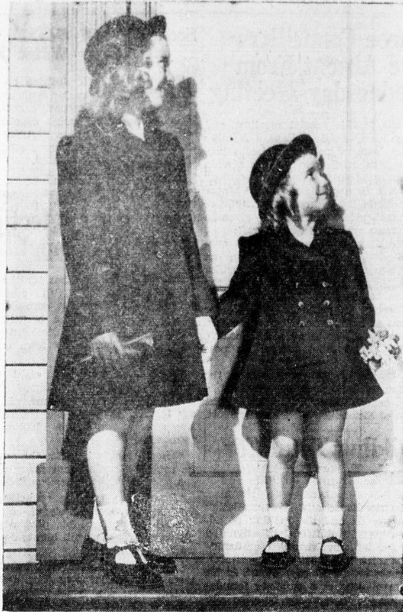
By PRUNELLA WOOD

THESE two little girls are dressed in their spring Sunday best... in navy wool reefer which will be none too warm many times before snow falls and it's time to bundle up really. The coats are fitted and flared to become best the roly-poly curves of sizes 3 to 6, and are double breasted. A red piping enlivens the collars. The roller hats are stuck with bright feather bits, and are blue to match the exceedingly smart little coat.