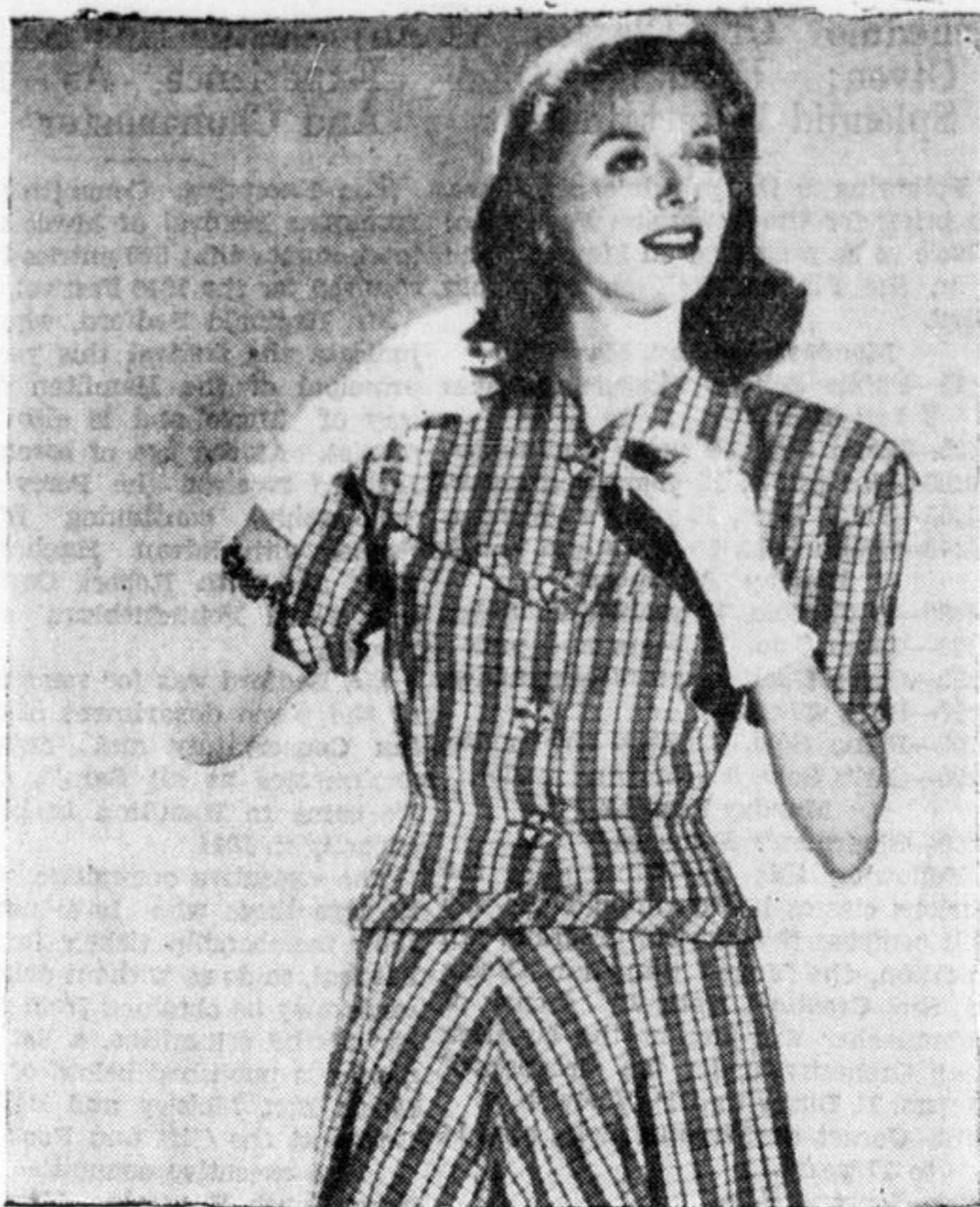
By PRUNELLA WOOD

THIS good looking two-piece cotton frock is made of fabric hand-loomed in Guatemala, and famous for its unusual colors, as well as its tailoring talents.