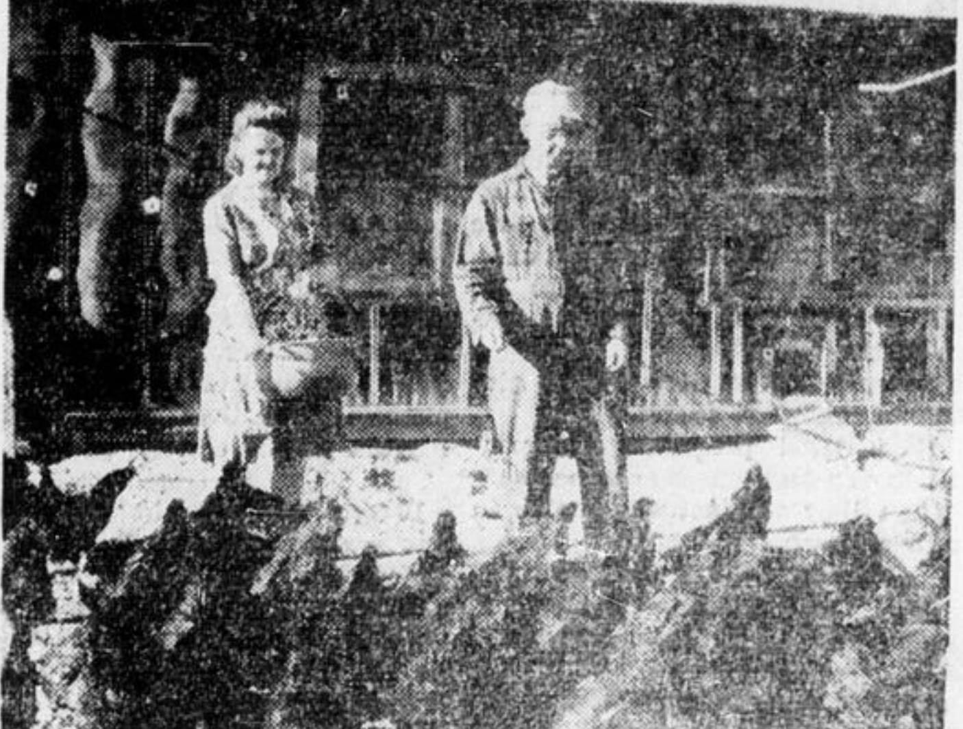
Chief aim of the National Reconstruction Conference at Ottawa is to achieve Dominion-provincial co-operation in post-war re-employment of veterans (top) and assistance to small industries such as the poultry farmer (bottom).