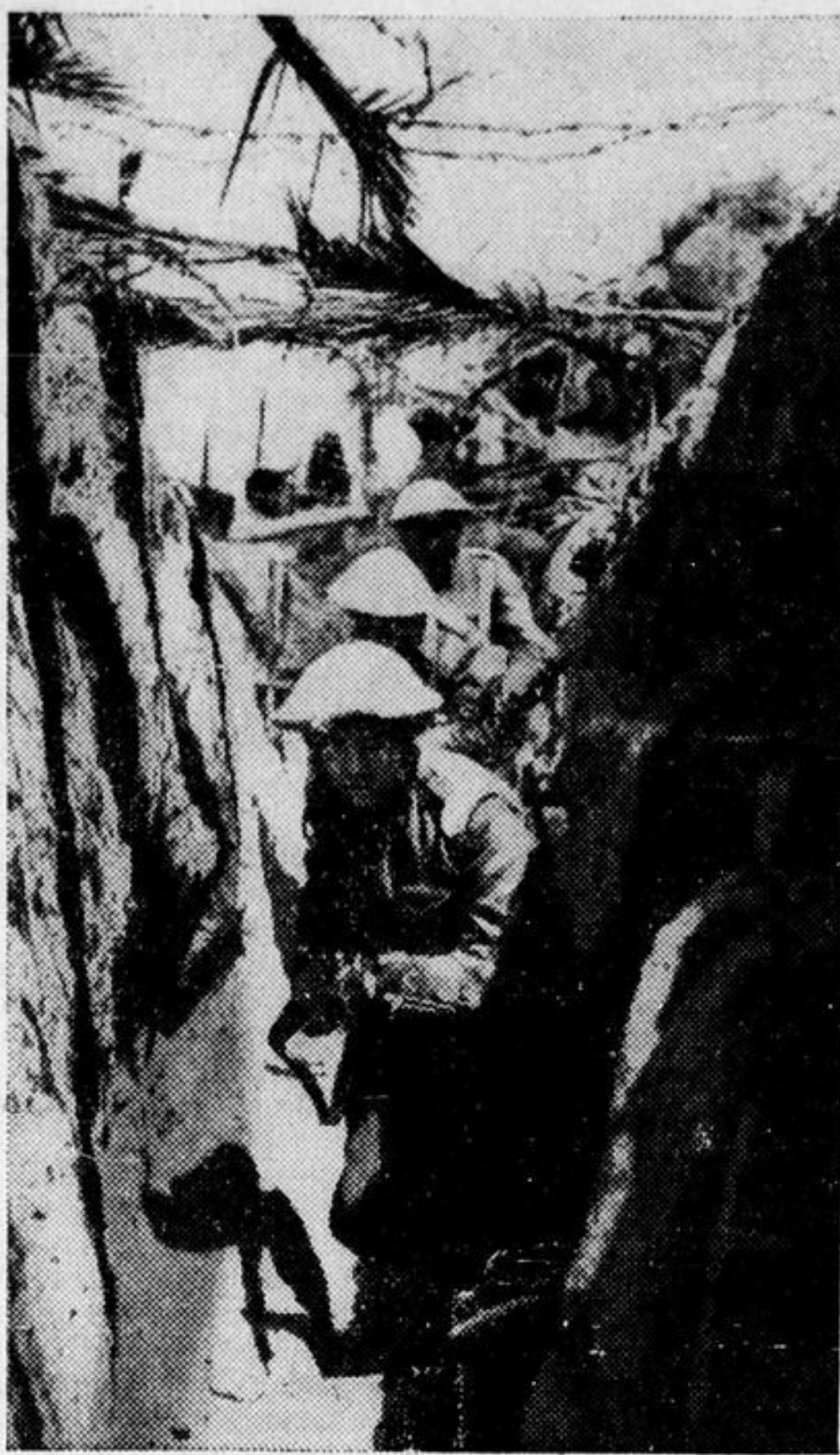
The 8th Army did it again. Rommel's defences on the March Line were smashed and captured. General Montgomery used his famous outflanking movement with crushing effect at Mareth. When he saw that a frontal attack would be costly in men and materials, he switched a strong force to Matma Mountains to join the assault in the enemy's right flank at El Hanna. Victory resulted. Many thousands of prisoners, both Italian and German, and much war equipment fell to the 8th Army. Picture shows: Men of the 8th Army mopping up one of the trench systems of the Mareth Line.