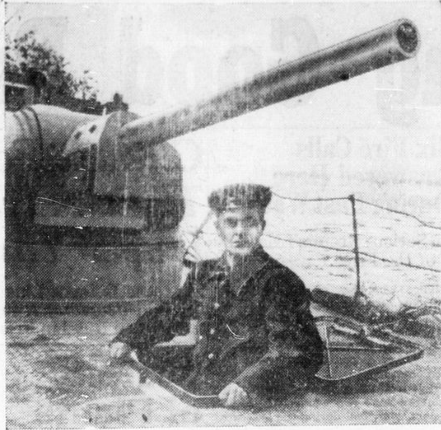
A Volga Boatman of To-day. S. Shilov, of the Volga Flotilla, Defender of Stalingrad.

Men of the Volga Fleet—many of them old tugboat skippers, fishermen, etc.—have distinguished themselves in the battle of Stalingrad. They fought beside the Red Army on land. They brought supplies through mine-infested water from the Volga banks and in constant danger of air attack. Photo shows: Red Navy gun Commander S. Shilov of the Volga Flotilla. In the fighting for Stalingrad his gun counted among its successes, the destruction of a large group of German automatic riflemen, two enemy blockhouses and a gun crew.—(U.S.S.R. Official photograph.)